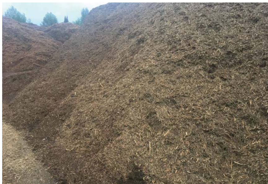
Biotechnology will transform biomass from waste product to valuable industrial raw material.

The plant is primarily a waste management facility and depends on gate fees for organic waste. The Spanish government pays a carbon premium of €7/t of CO 2 based on verified reductions in carbon emis-