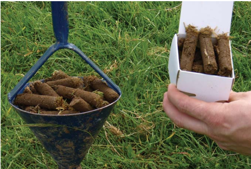
Ensure correct soil sampling depth for accurate soil P reading.

An up-to-date soil test result will show the soil pH and the lime requirements required to correct the soil pH to the target for the crop. Table 1