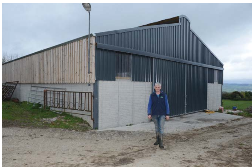
There is plenty of space around the new building.

ing in the roof may well have been worthwhile.” Additional artificial lightning has been provided at calf level to aid inspection.