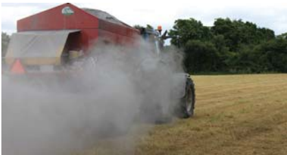
Only apply lime based on a recent soil test result. Over-application of lime will reduce the availability of soil P.