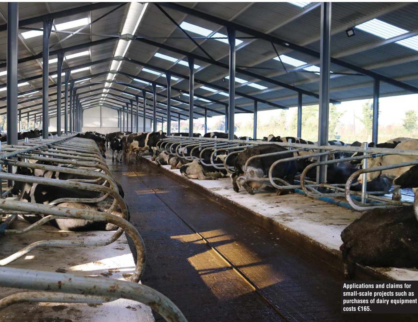
Applications and claims for small-scale projects such as purchases of dairy equipment costs €165.