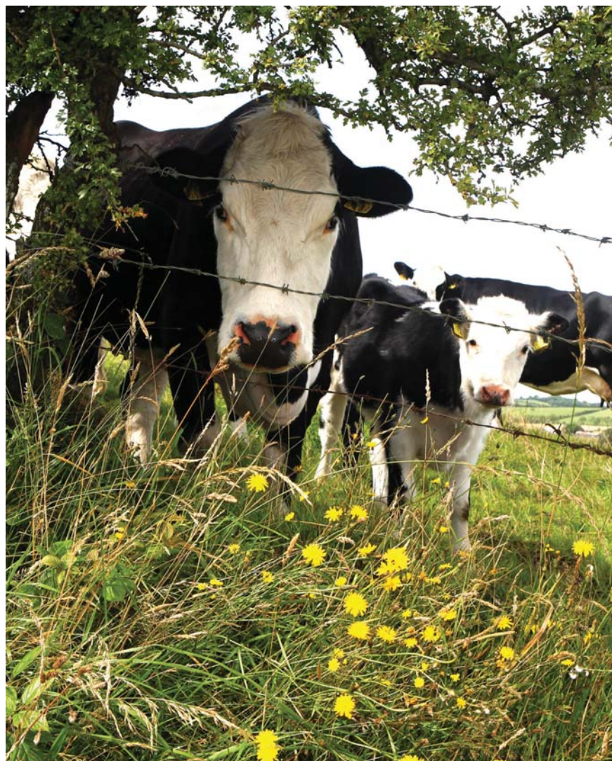
Dandelions: for some a weed, for others a trigger for precious childhood memories.