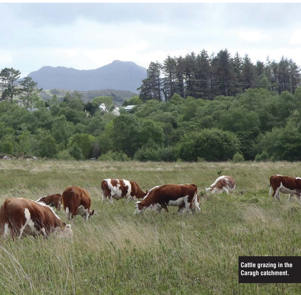
Cattle grazing in the Caragh catchment.

ingly. At present, there are 39 farm plans drawn up for the project area. Feedback from farmers has been very positive.