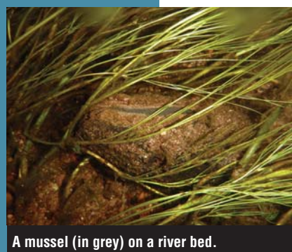
A mussel (in grey) on a river bed.

There are at least 96 individual populations of FWPMs in the Republic of Ireland and, of these, 27 rivers have been designated as Special Areas of Conservation. However, there has been a decline of freshwater pearl mussel populations, mainly due to the continuous failure to reproduce new generations of mussels.