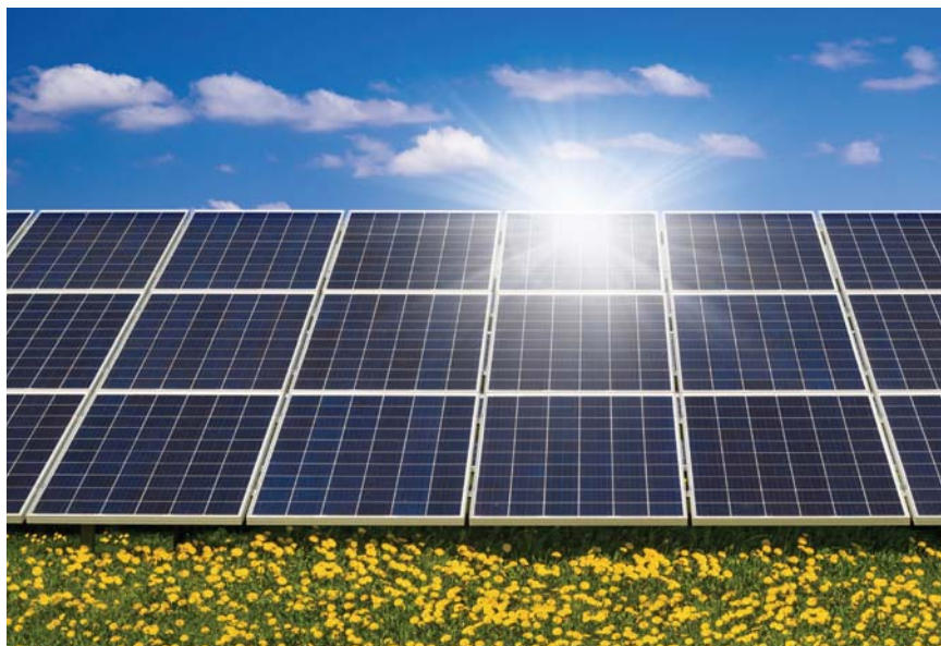
Agricultural land leased out for the purposes of siting solar infrastructure will continue to be classified as agricultural land and so will be an eligible chargeable asset for retirement relief.

and with a view to the realisation of profits.