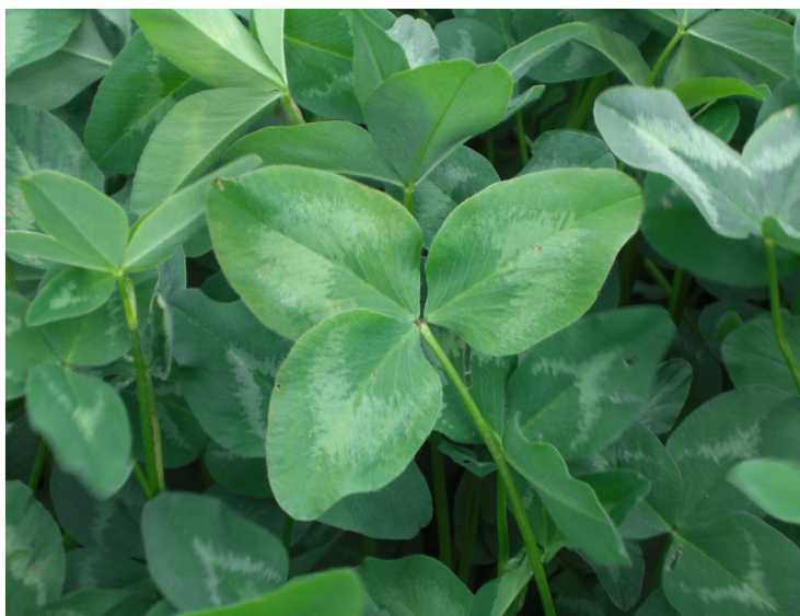
Red clover can fix 150 - 200 kgN/ha

Clover is the cornerstone of organic farming and the engine that drives productivity. White clover ( Trifolium repens L.) and red clover ( Trifolium pratense L.) are the main clover species used in Ireland. However, there are several significant differences between the two species particularly in morphology and physiology. In contrast to white clover, red clover has an upright growth habit and a strong deep root from which finer roots arise. The crown, located at the base of the stem, acts as a store of nutrients. Stems of red clover grow upwards from the crown. The optimum management and use of red clover is significantly different from that of white clover. The main role of red clover is for silage production.