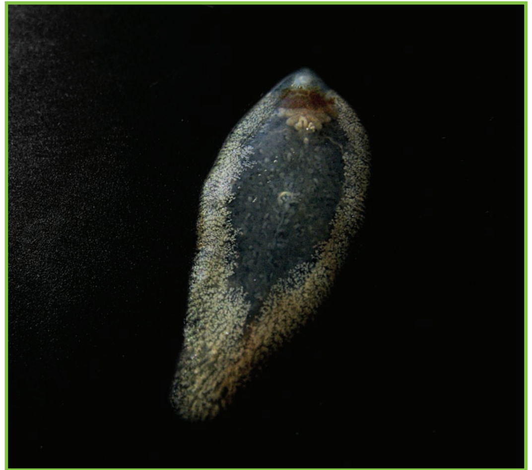
LIVER FLUKE SEEN UNDER A MICROSCOPE