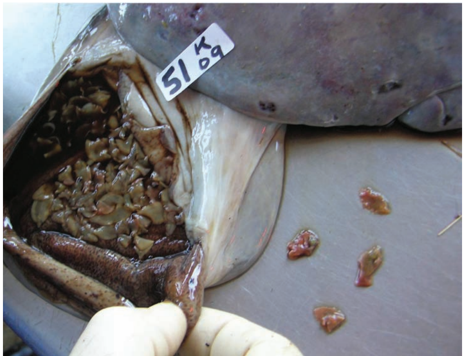
Mature Liver Flukes in Gall bladder of an infected animal

Animals may show a variety of obvious signs such as oedema (dropsy) under the jaw (bottle jaw), anaemia, diarrhoea, poor coat condition and lack of appetite. Liver fluke infestation can cause decreased fertility and wool production. However, the scouring animal with weight loss and bottle jaw represents the 'tip of the iceberg'. Detection of Subclinical infection with its adverse effect on growth rate, milk yield and fertility requires diagnostic tests such as blood tests (elevated globulins, low albumins, elevated GGT) and assessment of faecal egg counts.