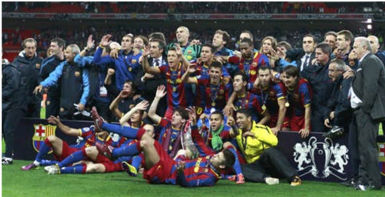
Barcelona's team celebrate with the trophy after winning their Champions League final soccer match against Manchester United at Wembley Stadium in London May 28, 2011.