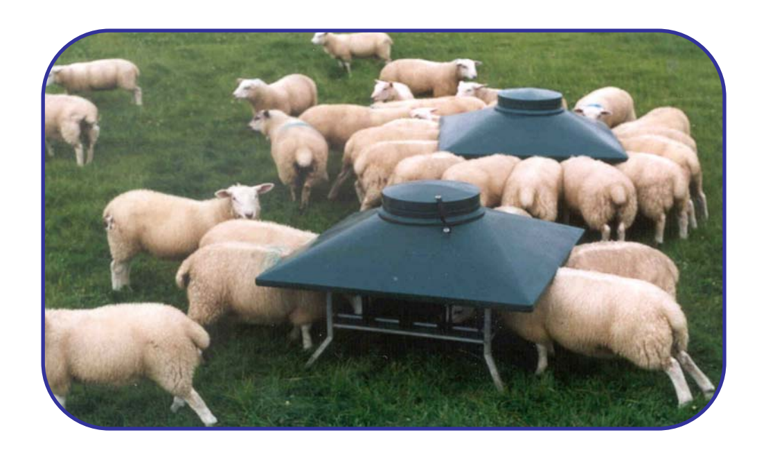
Teagasc data shows that creep feeding concentrate increases lamb performance and reduces age at slaughter by 28 days but may not improve margins

The data presented in Table 1 clearly show that high levels of lamb performance were achieved from grazed grass as the sole diet in a set-stocked grazing system. Increasing concentrate feed level increased lamb performance and reduced the age at slaughter, regardless of sward height.