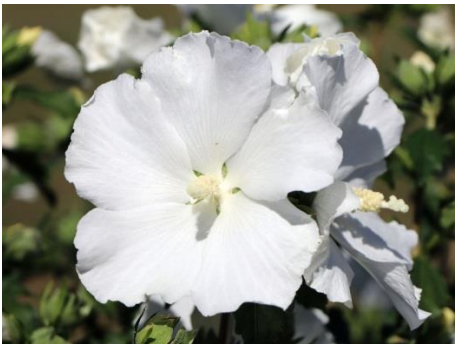
H. syriacus 'Eléonore'

Hibiscus syriacus 'Eléonore' PBR (below) came out as second best white flowering cultivar. The flowering lasted about 6-7 weeks and their growth was moderate.