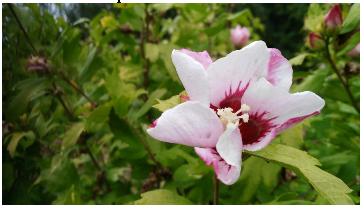
By Paul Fitters

For three years (2016 to 2018) 60 Hibiscus syriacus cultivars were compared for general performance at Pat Fitzgerald's nursery in Co. Kilkenny. The same cultivars were tested in several European countries as part of the Euro-trials.