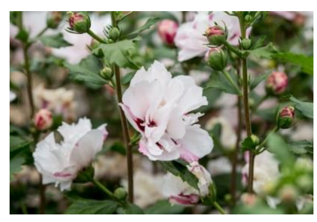
H. syriacus 'Leopoldii'

H. syriacus 'Mindour1' PBR (FRENCH CABARET RED) (right) came out as best red/ maroon flowering cultivar. It has double flowers that often failed to open properly under the Irish