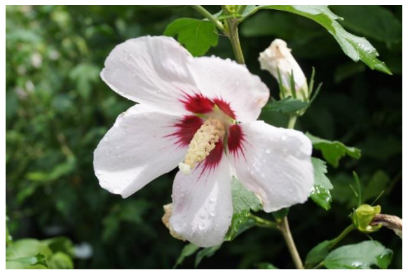
H. syriacus 'Melrose'