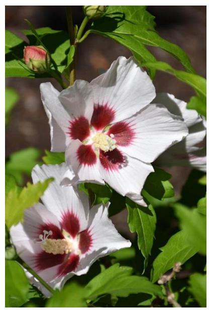
H. syriacus 'Mathilde'

Other good performing cultivars were 'Mathilde', 'Melrose' and 'Leopoldii' (the latter is a double cultivar which looks good even in bud, but flowers sometimes fail to open fully).