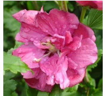
H. syriacus 'Duc de Brabant' PBR

weather, but as a result had a long lasting effect.