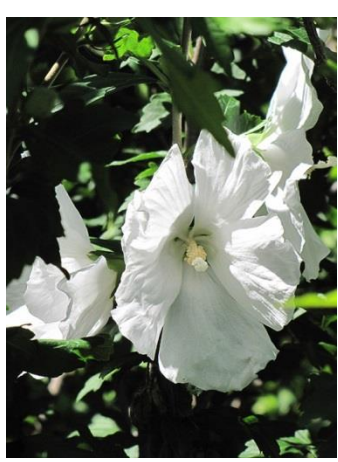
H. syriacus 'William R. Smith'

Another good white cultivar was H. syriacus 'William R. Smith' AGM (below), a single white long flowering cultivar.