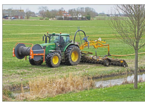
The more dilute the slurry is, the lower the level of nutrients in it.

Very watery slurry at 2% DM has approximately four units of N, two units of P and 13 units of K per 1,000 gallons. At 4% the slurry is quite watery but contains six units of