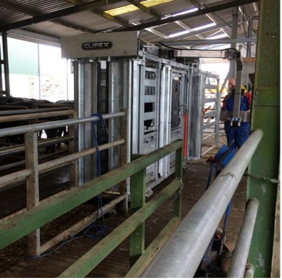
New Clipex weighing facility