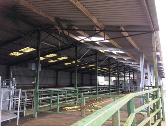
New crush loading facility and shed extension

The grazing area of each the trial farmlets has been increased proportionately to allow for the extra stock that we are carrying now that all steers are being killed off grass during the summer months.