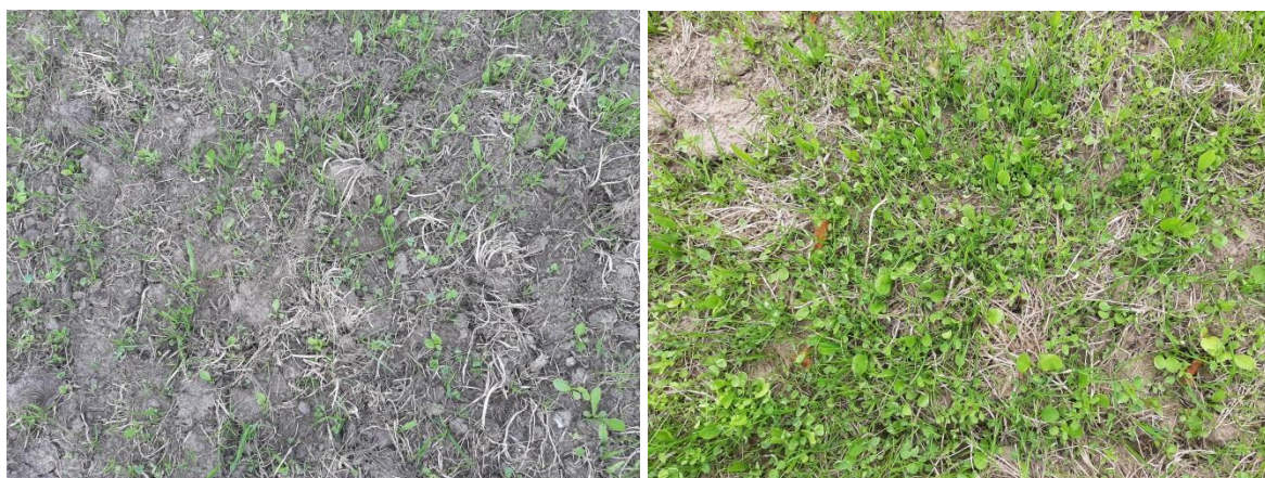
PRG + Clover + herb reseeds in two paddocks, the heavier paddock has advanced further