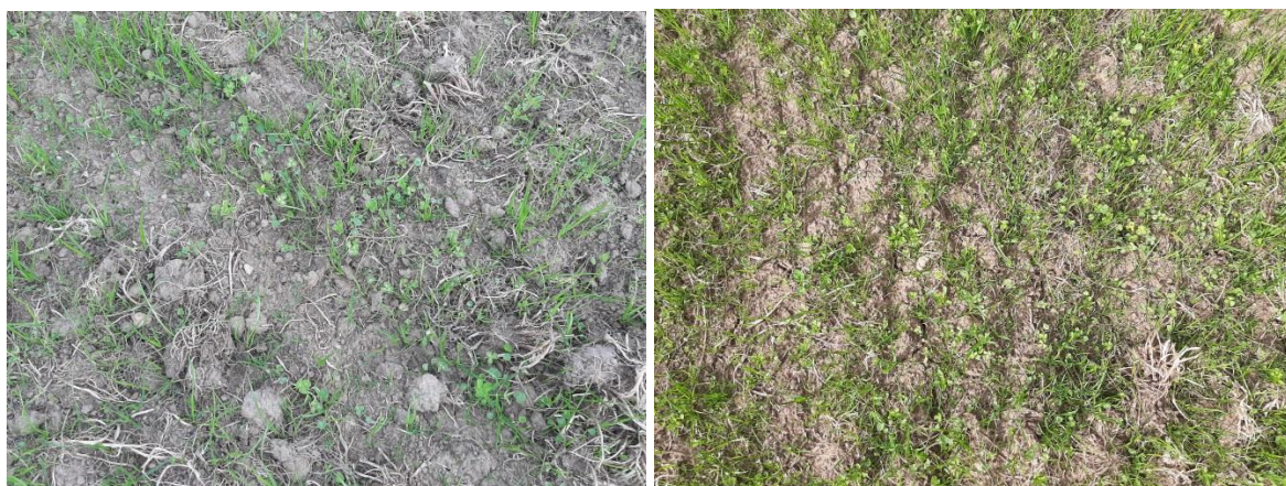
PRG + Clover reseeds, the heavier soil type has greater germination and seedling growth (right)