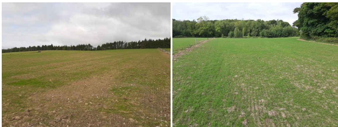
Comparing reseeds on a light (right) and heavier (left) soil. All images were taken the same day (27 th May). The paddock on the left has PRG only; the right paddock has PRG + Clover.