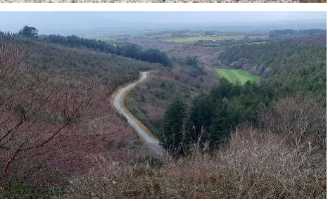
10 An Roinn Talmhaíochta, Bia agus Mara | Department of Agriculture, Food and the Marine