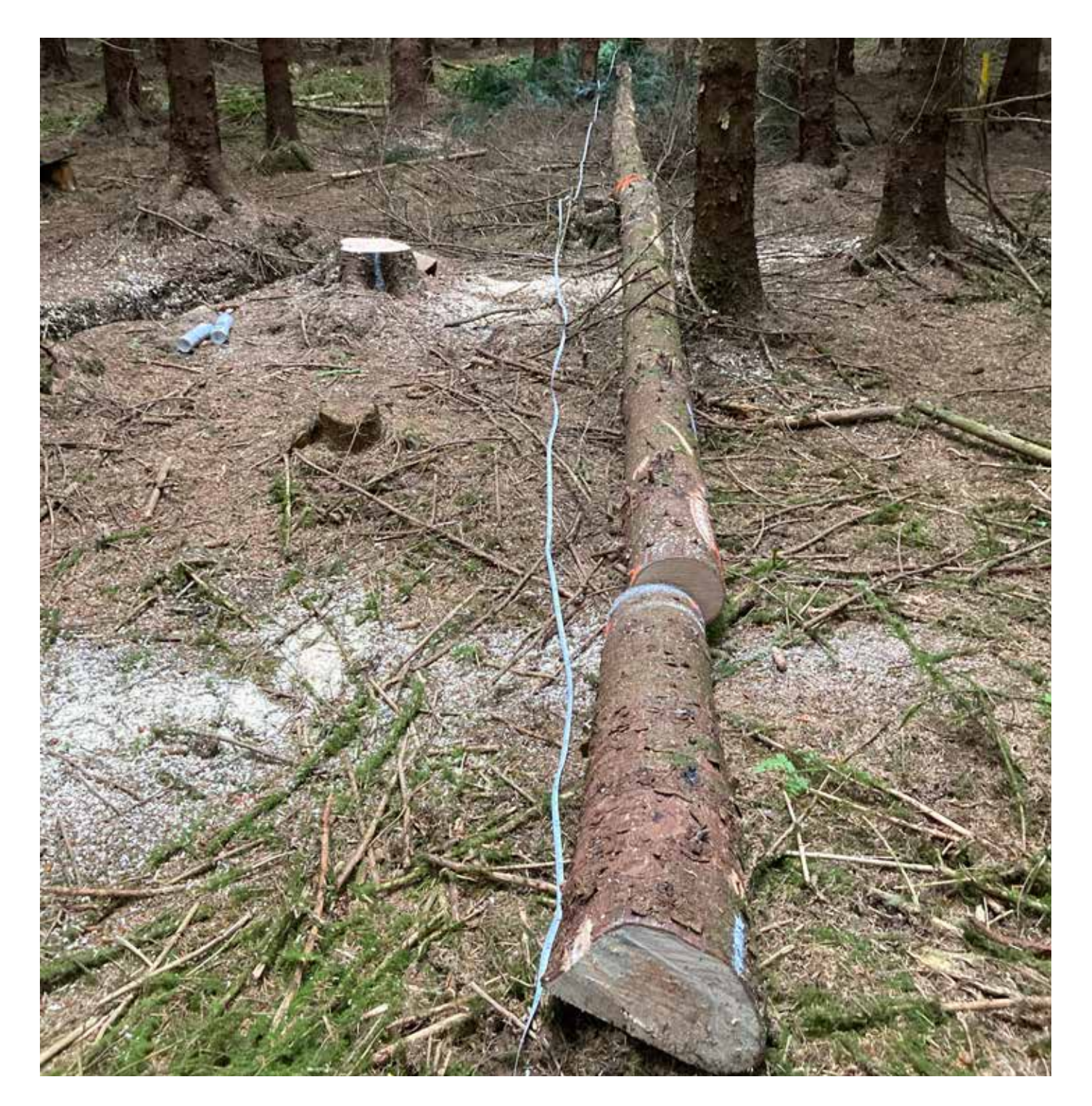
Figure 5: Felling and taking discs from sample Sitka spruce for tree ring analysis to study if drought conditions can be detected.