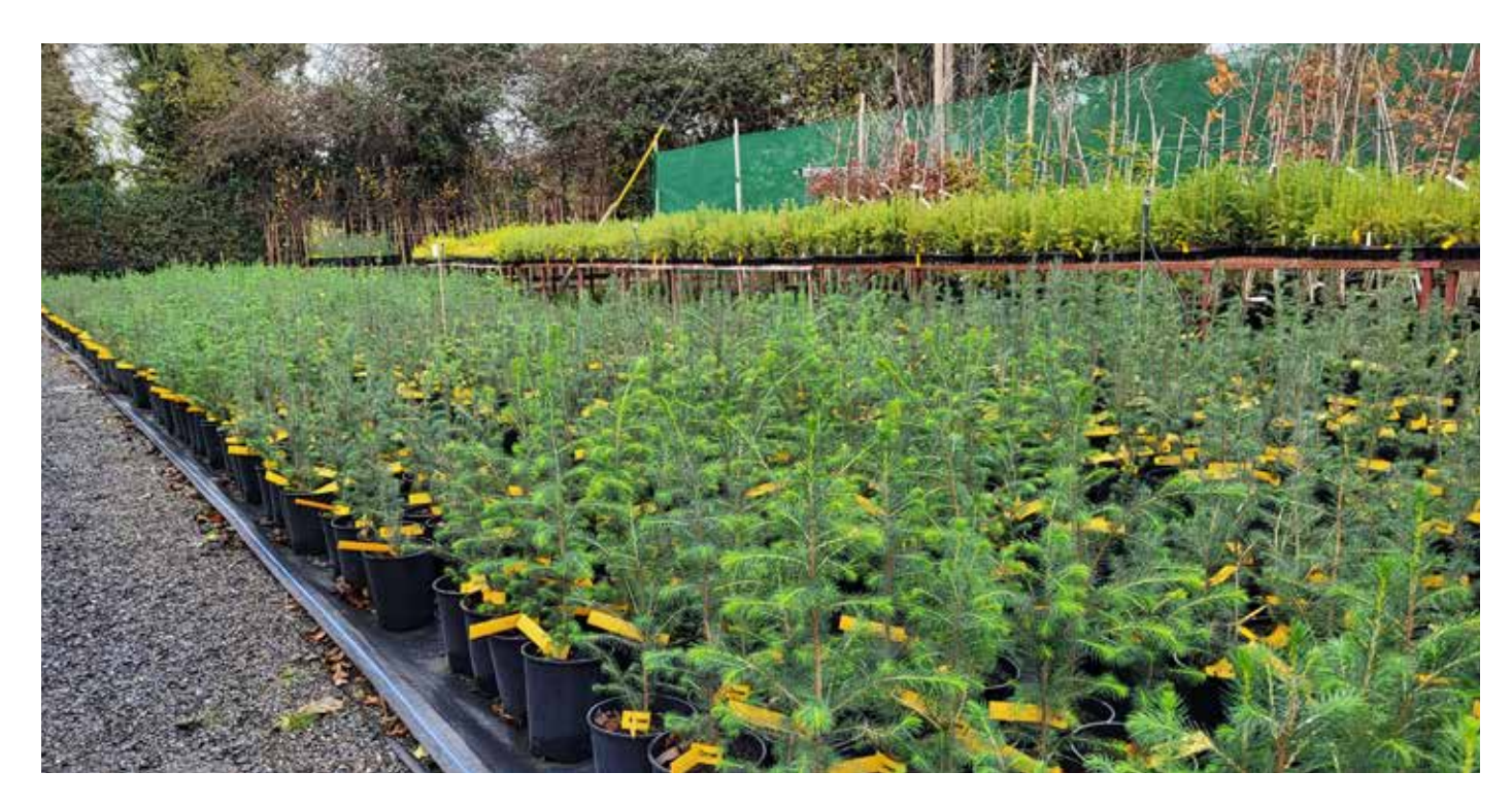
Figure 3: A Sitka spruce growth and phenology experiment at Teagasc research centre in Ashtown, Co. Dublin.

A growth chamber manipulation experiment will be used to investigate the impact of changes to water availability, increased temperature and increased CO2 concentration on the growth and physiological activity of Oak, beech, Douglas fir and Sitka spruce. Measurements of phenological development and physiological activity (using measurements such as whole-plant respiration, water use, photosynthetic activity, chlorophyll fluorescence) in response to the altered environmental parameters will be conducted. Physiological measurements will be taken to assess if differences in chlorophyll fluorescence or photosynthetic activity are detected owing to the different treatments.