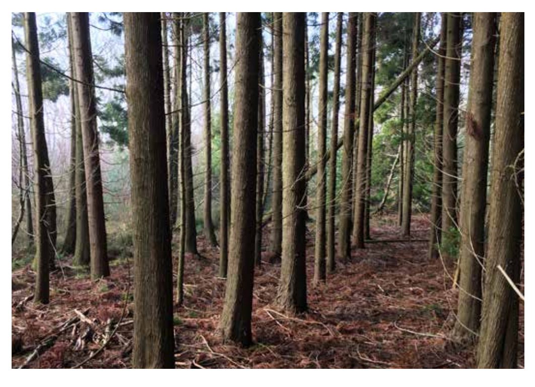
Figure 2: Species like Japanese red cedar (Cryptomeria japonica) here in Deputy's Pass, Co. Wicklow may have increased potential in Ireland as the climate warms.

An understanding how seedlings respond to a changing climate will be vitally important in developing adaptive strategies for sourcing appropriate forest genetic material for use in forests of the future. A diverse range of Sitka spruce seed origins which have been assembled in Ashtown Research centre in Co. Dublin in June 2021 with the aim of monitoring seedling growth phenology (timing of budburst, growth cessation, shoot elongation) in relation to current (outdoor environment) and altered temperature condition (indoor environment) (Figure 3). The data will be used to compare the phenology of the different seed origins in relation to the two environments to assess what effect if any effect of elevated temperatures on growth phenology of different seed sources.