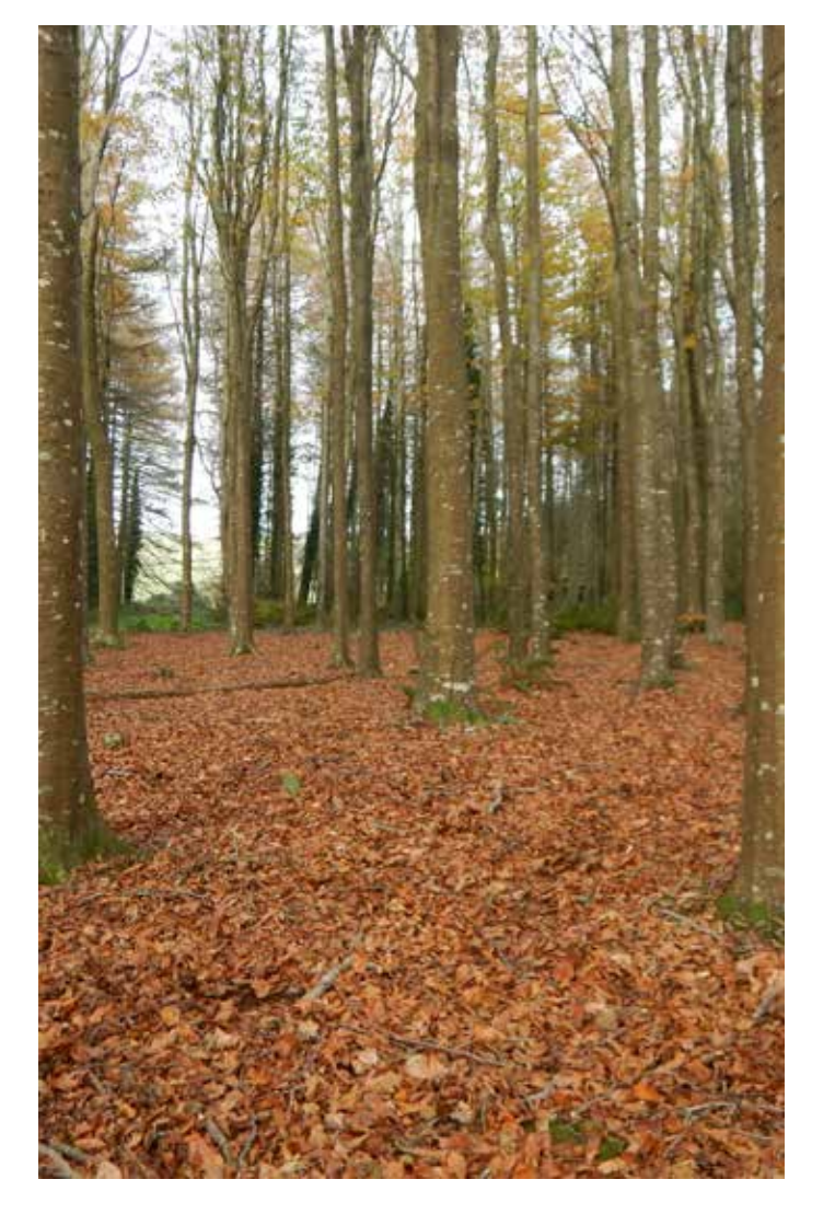
Figure 1: A good example of a demonstration plot of Oriental beech (Fagus orientalis) in JFK Arboretum, Wexford showing good adaptation to site and the Irish climate

fitness of the current range of broadleaved trees and seed orchards for future use and for seed production as a result of a change in climate. Finally, we aim to assess if diverse material of Douglas fir and Sitka spruce which may have undergone natural selection and adaption in warmer conditions is suitably adapted to current and future climatic conditions in Ireland