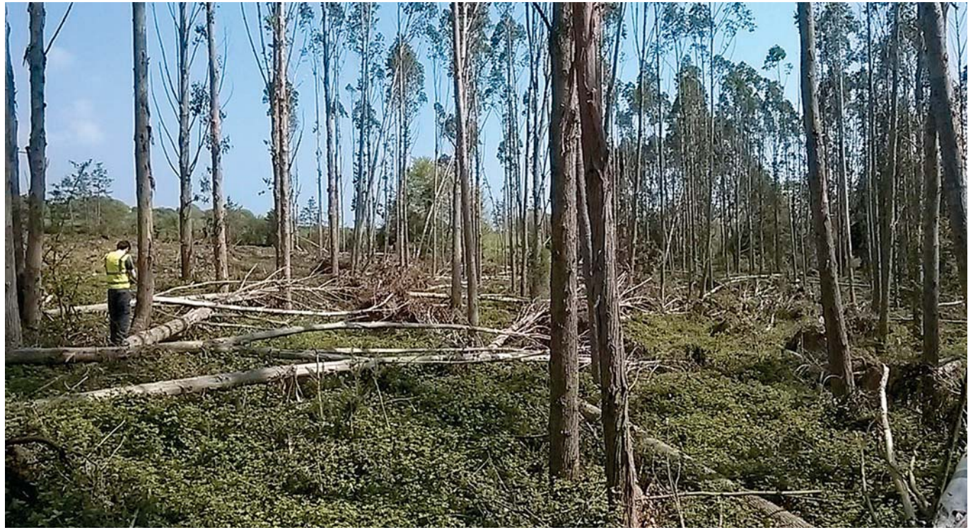
Figure 2: Eucalyptus delegatensis stand at Kilbora, Co Wexford, planted 1992, c. 22 years old, partially windblown by the February 2014 storm.