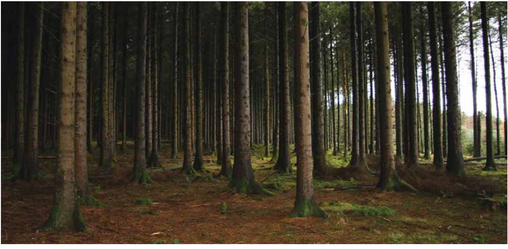
Mature Sitka spruce.