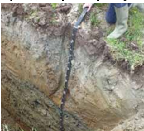
Fig. 1a .Test pit excavation

Clean aggregate should to be used to surround the land-drain pipe in conventional and deep drains. The gravel should be filled to a minimum depth of 300 mm from the bottom of the drain to cover the pipe. The stone should provide maximum connectivity to a layer of high hydraulic conductivity. The purpose of a drain pipe is to facilitate a path of least resistance for water flow. In long drain lengths (greater than 30m) a drain pipe is vital to allow a high a flow-rate as possible from the drain, stone backfill alone is unlikely to have sufficient flow capacity to cater for the water volume collected. Only short drain lengths (less than 30 m, or the upstream 30 m of any drain) are capable of operating at full efficiency without a pipe.