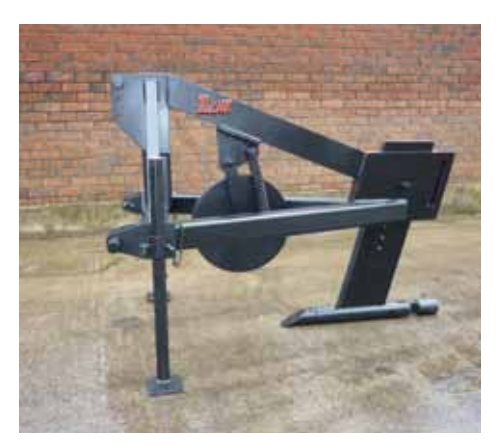
Fig. 2a. Mole plough showing cylindrical foot and expander.

The effectiveness of mole drains depends on the extent of suitable cracking during installation. As such the ideal time for carrying out mole drainage is during dry summer conditions, this will cause maximum cracking in the upper soil layers as well as facilitating adequate traction preventing wheel-spin on the surface.