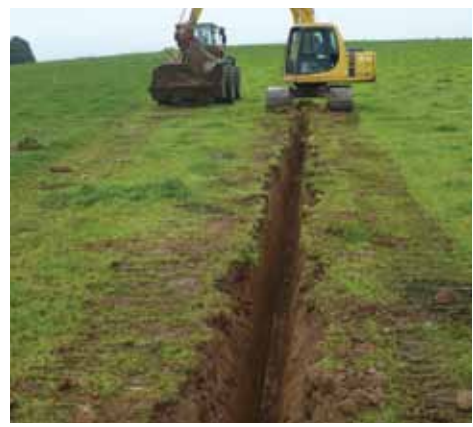
Fig 1b. Drainage trench excavation