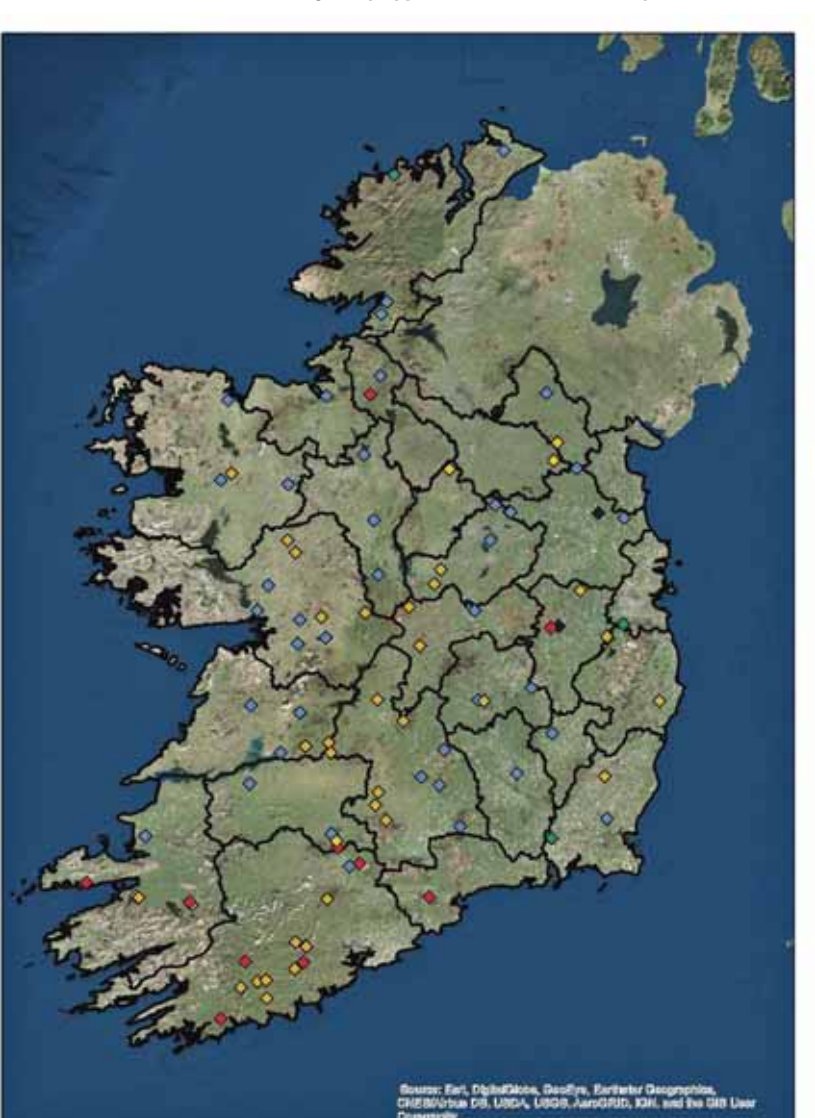
Figure 1: The distribution of quarry types around the country

Currently there is little guidance on the availability and cost of these materials from around the country. A survey conducted in January 2019 aimed to assess this variability in cost and availability of suitable materials. Twenty-five counties are represented within the survey, in which 93 quarries were assessed for the availability of materials and their related costs.