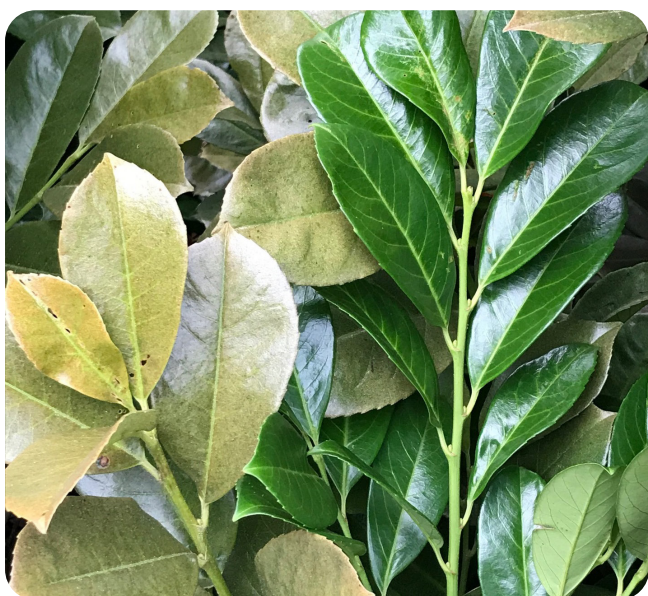
The pale leaves of leaves of laurel foliage caused by damage from Citrus Red Mite on LHS compared to the normal coloured foliage on RHS.

Citrus Red Mite ( Panonychus citri ) is found mainly on citrus but the pest also occurs on many other hosts including cherry laurel on occasions. It is recognised by red eggs rather than colourless ones as in the two-spotted spider mite. The mites cause noticeable silvery, yellowing or speckling by feeding on the undersides of leaves. They can cause defoliation in severe infestations. Contact your adviser for further information if citrus mite is suspected.