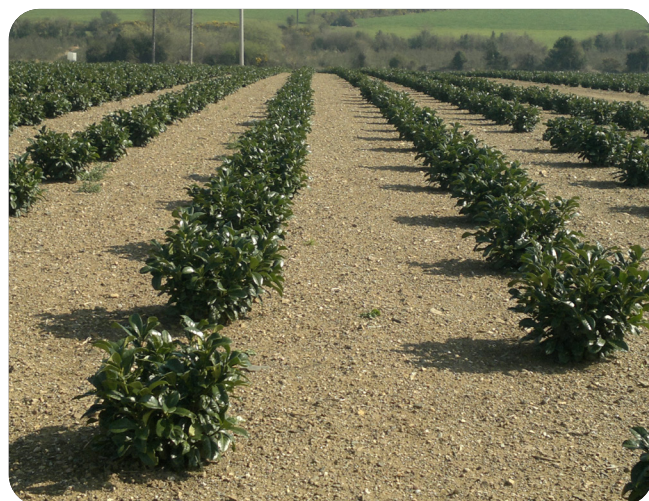
Field scale planting of P. l . 'Etna'

Planting is carried out in rows 2m apart, with plants also 2m apart in the row. This gives an overall plant density of approximately 2200 plants per ha (900 plants/ac). A 3m wide tramline should be left every 10-12 meters, depending on tractor and sprayer widths, to facilitate tractor operations and ease of harvesting. Higher density systems can be adopted but a more intense level of plantation management is then required.