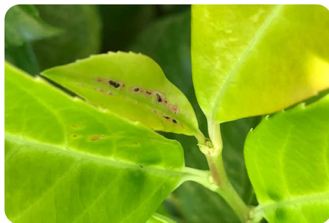
Thrips damage on cherry laurel.

Thrips ( Thrips flavus ) which is the yellow flower thrips can be a pest of laurel. The young larval stages tend to feed in the enclosed shoot tips and the resultant damage takes the form of a speckling where the epidermis is heavily scratched at either side of the mid rib of leaves as the young shoots unfold. In severe cases, some holes may result but it is thought to be rare. It is suggested that the damage may be an entry point for bacterial pathogens such as Pseudomonas syringae . The IPM approach to control as outlined for tortrix moth should be considered in controlling thrips.