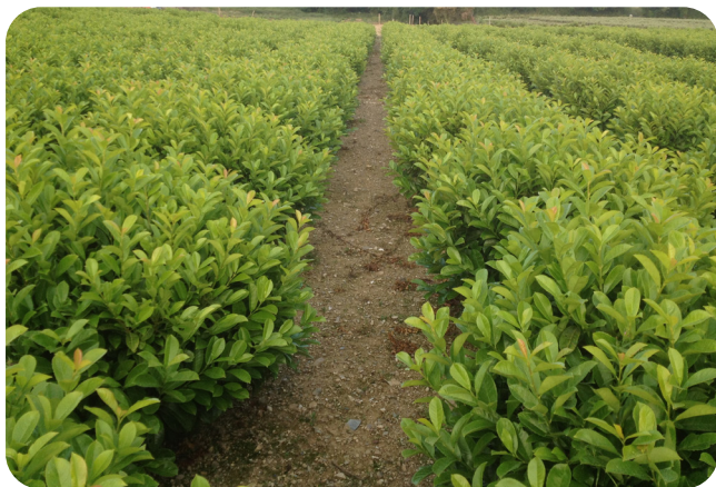
Cherry laurel plantation in south of Ireland

This factsheet has been prepared from the results of Teagasc trial work, the results of the DAFM 'New Leaves' project which focused specifically on pest & disease issues and recorded experiences of growers in the South of Ireland.