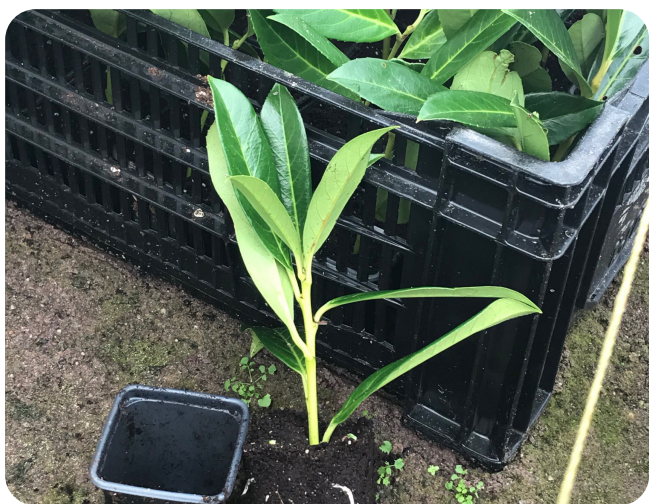
Plants of Prunus laurocerasus 'Caucasica' ready for field planting

Plants are supplied by specialist propagators. They are generally raised from cuttings which are taken in the autumn and well rooted plants in 7cm liners are usually ready for planting out 6-8 months later.