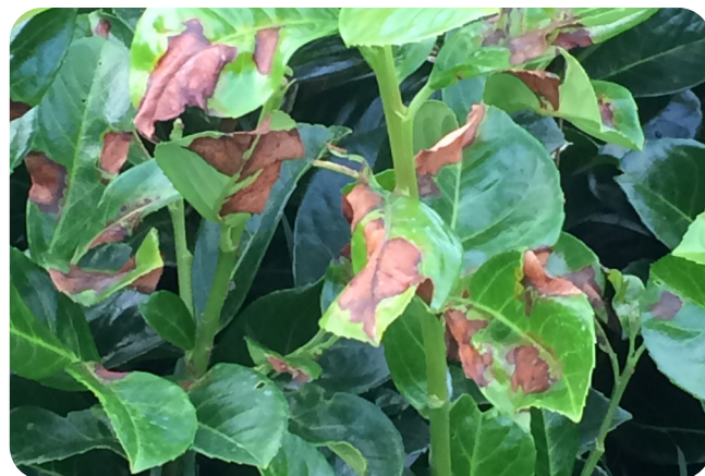
Downy mildew damage on cherry laurel

Potato blight warnings are a good indicator of when infection periods are likely. A preventative program is recommended in a high pressure season and one should consult an adviser on choice of fungicide.