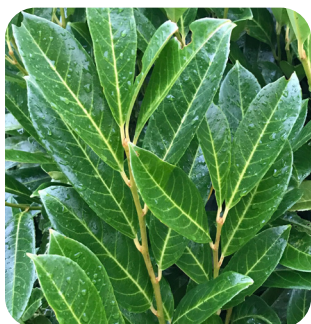
P. l . 'Etna' (L) and P. l . 'Caucasica' (R)