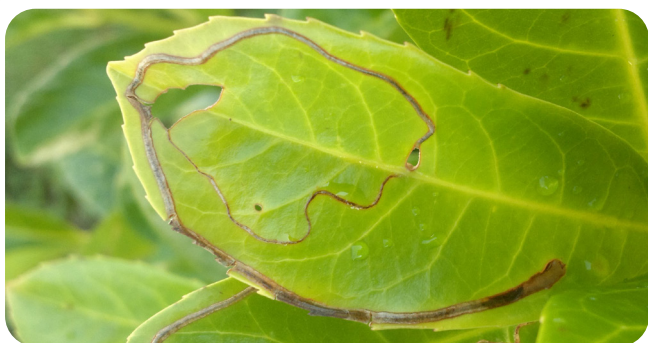
The characteristic damage caused by the apple leaf miner