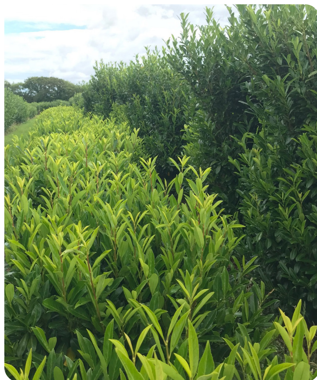
Prunus laurocerasus 'Caucasica' Pruned (L) and unpruned (R)

If the bushes grow out of shape or too high for hand harvesting, then a hard pruning to 1.2 m in spring will allow the crop to get back into the production cycle; however the first flush of stems after severe pruning are likely to be soft and susceptible to pest and disease attack as they take some time to build up metabolites that help boost the plants defence system. In this instance, a thorough program of plant protection may be necessary to ensure quality marketable stems.