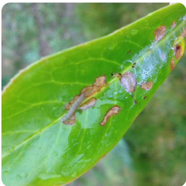
Typical Tortrix moth damage on Laurel

can result in small to large holes and subsequent growth leads to deformed leaves which can render stems unmarketable. Insecticidal treatments are justified where there are serious infestations and the pesticide choice should be carefully considered under an integrated pest management (IPM) approach to control. Consideration should be given to the contribution of beneficial insects within a plantation as they can play a valuable role in the fight against tortrix. Adult moths and the resulting damaging larva are usually active from late May-July and again from late August-October when both the adult and caterpillar are prey for many different predators. The larva are attacked by generalist predators that include bugs and fly larva and by the larvae of parasitic wasps. Typically, generalist predators are present in abundance in late June till the end of the growth season and the parasitoids are present when the larva are active on the foliage. Therefore in order to maintain a population of beneficial insects in high risk plantations, only insecticides compatible with an IPM system should be considered.