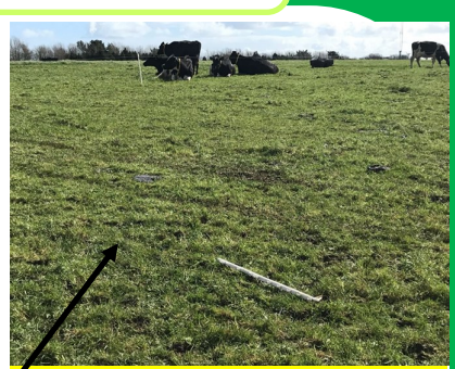
Cows at Teagasc Johnstown Castle doing a great job cleaning out paddocks. Pre- grazing yield was 1250 Kg/DM/Ha

Our first round of fertiliser only went out in early March, we've followed that up last week with a further 30kgs/N/ha of pro-• tected urea (29%N, 14%K product spread @ 100kgs/ha or 40 units per acre). Silage ground will be topped up when we're sure what plots are for silage. The good ground conditions allowed us to follow the cows with 2000 gals of slurry using LESS on most paddocks grazed. Paddocks that received slurry did not receive artificial N.