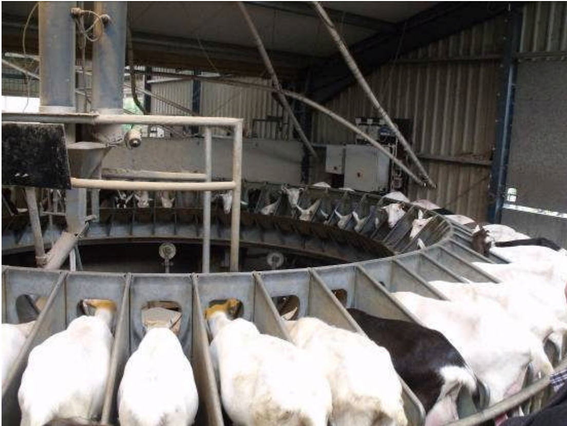
Figure 20. Meals are fed in rotary units in each of the goat sheds.

The attitude towards health on the farm is that prevention is better than cure and the vet has a proactive involvement as a consultant, visiting the farm at least once a week. This is a closed herd and disease is kept off the farm. The animals are kept in healthy conditions and are fed very well. The general life cycle of the goats on the farm is as follows: