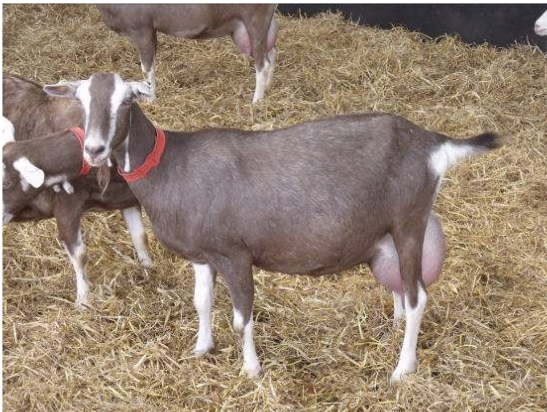
Figure 12. A typical example of a high genetic merit goat, note the quality of the udder.

The breeding policy is to create a hybrid of Toggenburg and Saanen with males being sourced from as few herds as possible. Males are currently the only animals bought into the farm and must come from herds with excellent health status, good functional type and adequate production. The aim is to breed males from animals that have been proven to perform in the farm system and reduce the number purchased from outside. Since Phil started farming Jane Miller has chosen the males for the herd and has had a major influence on breeding policy. Recently they have formed a partnership with the aim of creating a nucleus herd to produce animals for the commercial herd and also some males for sale. Phil says that Jane's breeding knowledge will be key to the development of both the nucleus and commercial herds. Milk recording has also been carried out over the past year and has allowed the identification of unproductive animals. In general the best animals in the commercial herd are chosen for the nucleus herd. These may not be the very top milking animals but certainly must have the best functionality i.e. good feet, udder size, teat position. Phil says the goats must work in his system, any animals that don't are culled.