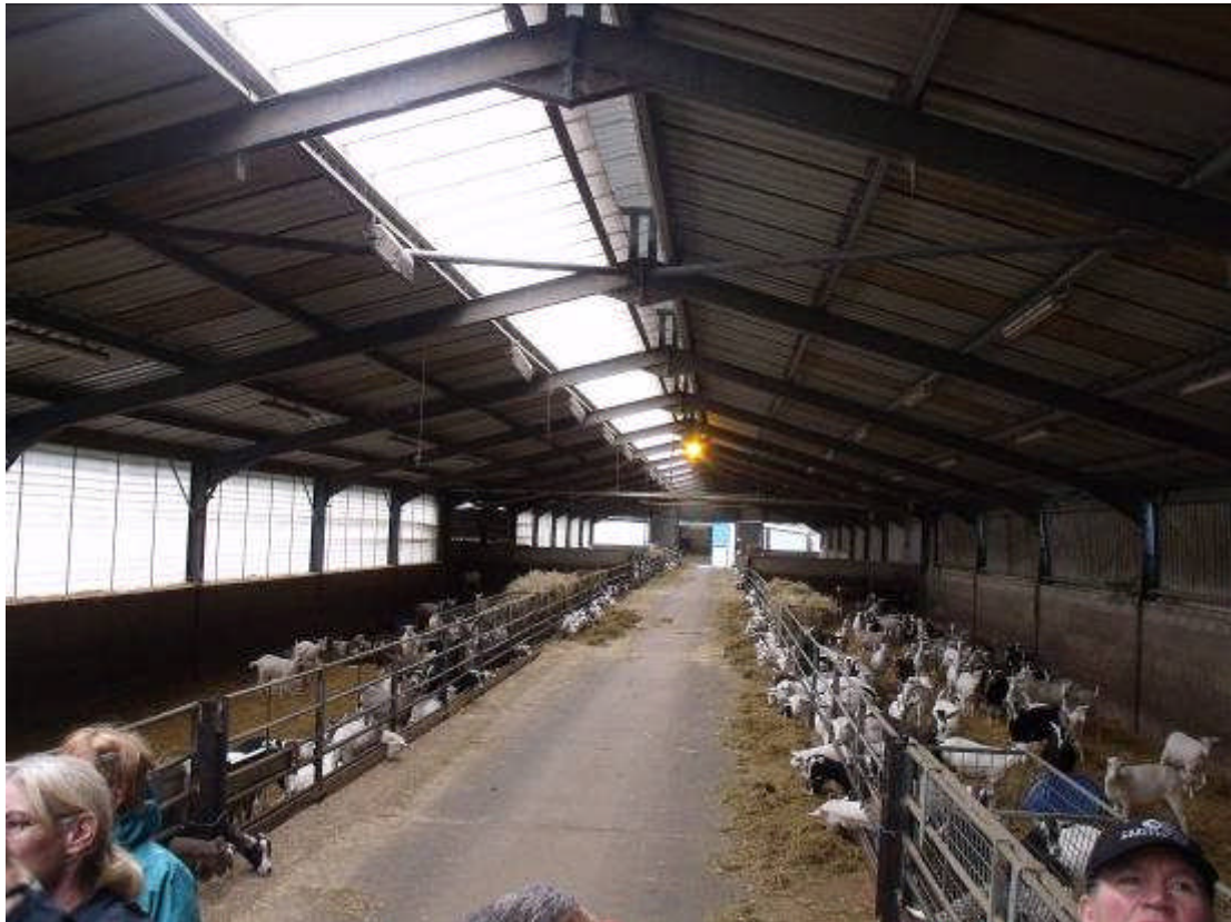
Figure 20. Forage is fed in along a central feed passage in the sheds.

Goats are fed a TMR (Total Mixed Ration) in along a feed passage in the shed. Meals are also fed in a rotary unit in each shed, a total of 4 are present on the farm. Maize was previously used as part of the diet but grass and Lucerne are now grown to produce hay and haylage.