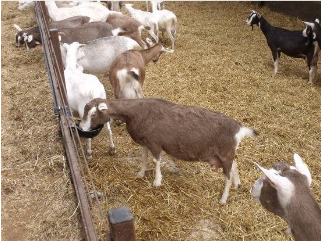
Figure 9. The current drinking bowl setup. Phil would change this in an effort to reduce lameness.

Several feeding systems have been tried including looking at various systems used in France and Holland. The base diet is now made up primarily using whole crop cereals. This provides a diet that has high dry matter content and provides good levels of digestible fibre. Phil states that high intakes in the goats are dependent on a high dry matter diet and has spent a lot of time tweaking it to ensure it is correct. He also feels that unlike grass silage, whole crop wheat is a much more consistent forage and that whole crop wheat is well suited to the damp climate. The wheat crop is preceded by a 3-year hay sward that contains red clover. The nitrogen fixed by the clover means that the wheat only requires 50kgs N/Ha. It is sprayed off when still a bit green and is treated with urea before storing in a pit. Phil feels silage is at it's best at about 30% DM. Above this results in mould in the pit and below it leads to reduced intake.