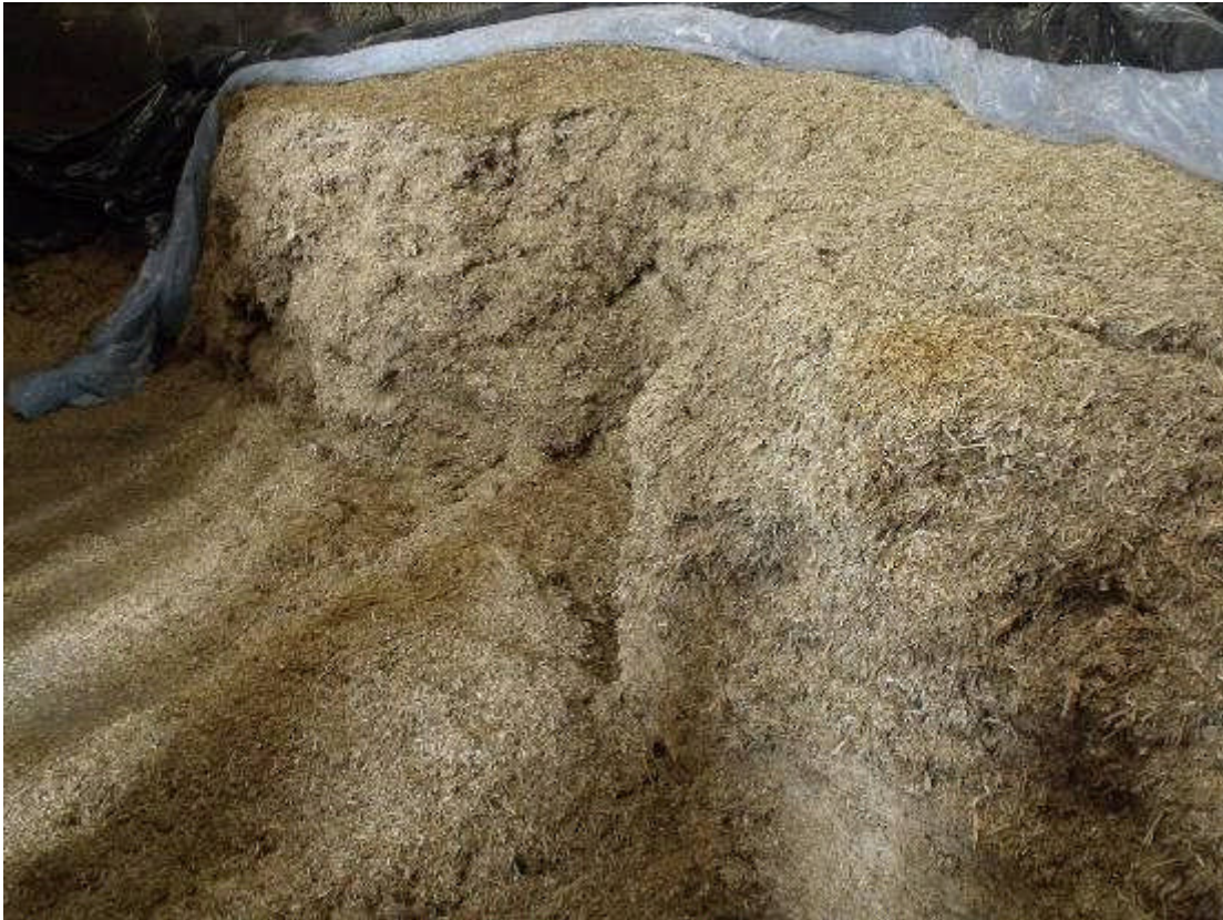
Figure 10. The pit of whole crop wheat fed as part of a mixed ration.

Any waste material left by the goats is removed and fed to the cattle. Phil says you should always have some feed left by the goats as yields will suffer if you try to make them eat it all. A minimum of one linear foot feed face is allowed for each animal, if the goats can't all feed at the one time production decreases. Although the reduction is only about 0.1 litres per head, with large numbers of animals this all adds up. The height of the step at the feed face is also important Phil has found that if the level of the dung rises over the level of the step, intake decreases. This may be due to the fact that goats like to browse and reach up to feed on bushes and shrubs. Intake is hugely important in milk yield and a lot of time has been spent fiddling with the diet to get it correct. The current diet is: