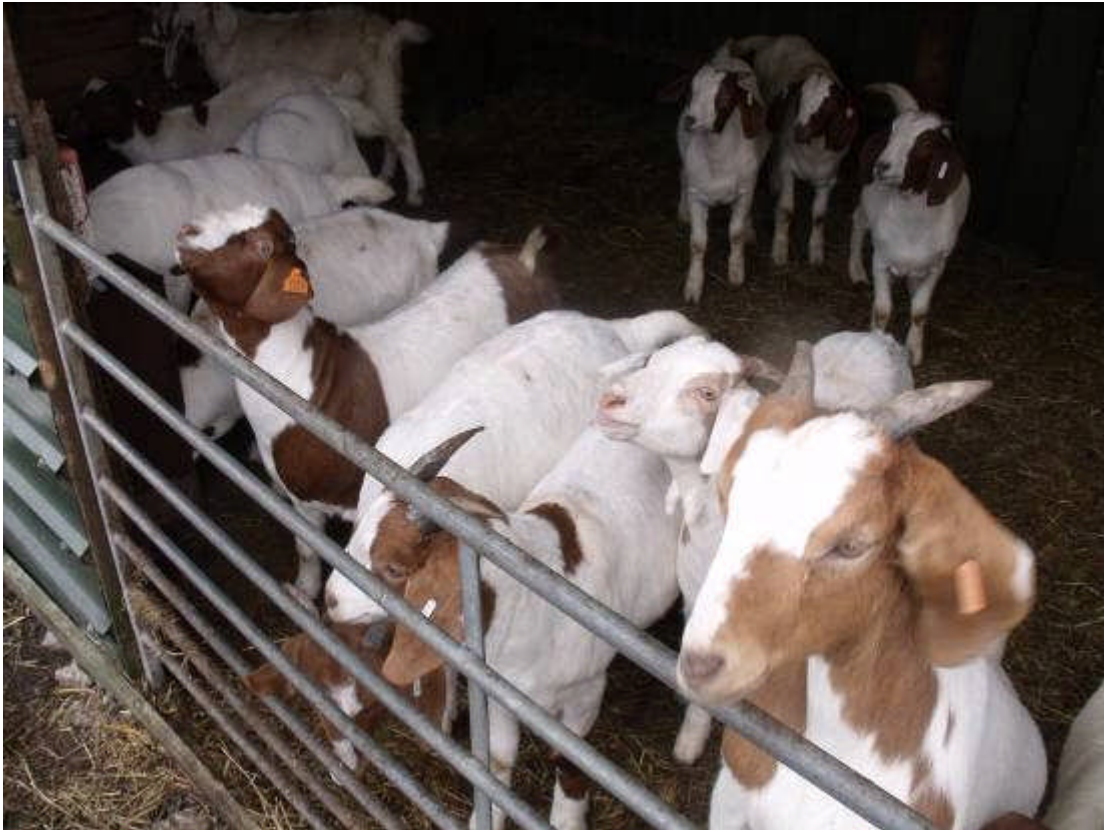
Figure 15. Goats are housed on ad lib meals before slaughter.

Ensuring the goats have the correct level of minerals is hugely important and the mineral bill on this farm is four times the feed bill. Boer goats have a very high copper requirement and each animal gets a copper bolus every two months. In addition 'Red Rockies' mineral lick is provided for animals at all times. This is specifically designed for cattle but is very useful in avoiding mineral deficiencies in goats. There have been occasional problems with 'crusty' ears and nose. This was diagnosed as a cobalt deficiency and the goats are drenched every 2 months to prevent this.