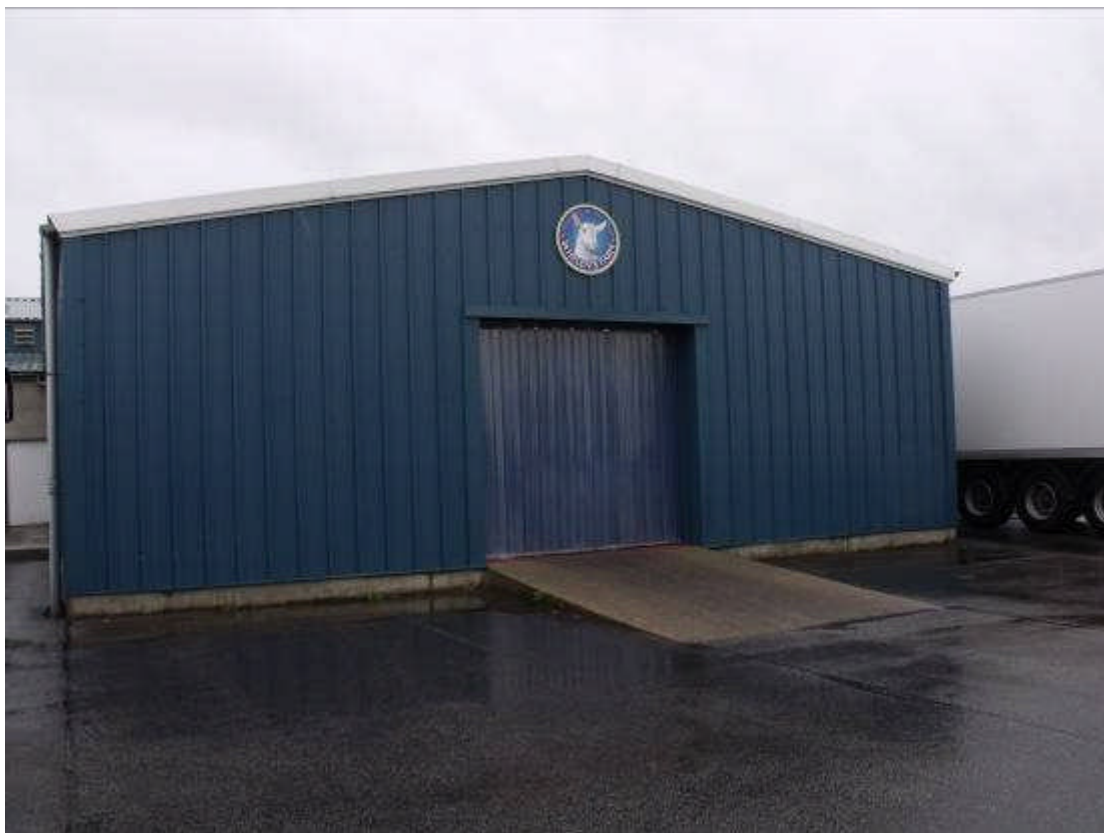
Figure 17. One of the storage sheds along with the very recognisable St. Helens brand logo.

St. Helen's Farm was founded in 1986 in Barmby On The Marsh, about 14 miles from its current location. There was a small redbrick yard and a total of 5 acres. By 1993 however, it was time to expand and the farm moved to a new location. Work began on the new yard in July 1993 and was completed for milking in February 1994. Some level of construction has taken place on this site every year since, apart from 18 months during Foot and Mouth. Two holdings now make up the farm – Seaton Ross (270 Ha – Goat, Arable, Dairy) and Ottringham (350 Ha – Goat & Arable) and a further 11 farms supply milk for the broad range of products manufactured on site. At Seaton Ross they produce almost 9 million litres of milk per year along with 550 tonnes of yoghurt (full, low and flavoured), 200 tonnes of butter and also some cream. There is also a cheese production unit – Cricketer Farm in Somerset. If an excess of liquid milk is being produced it is sent to the cheese unit. The farm is totally focussed on supplying milk to the consumer, particularly through Tesco and Sainsbury.