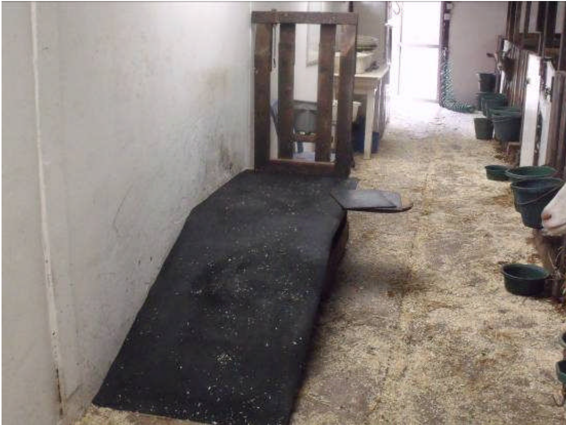
Figure 3. The milking station in Jane's shed.

All goats are disbudded by the local vet under local anaesthetic when they are between 2 and 5 days. Although there are differing opinions regarding local anaesthetic in young goats, Jane says she has never had a problem. It is illegal to disbud your own goats in the UK. No male goats are sold under three months of age as it is vitally important to spend as much time as possible with the young animals before they are moved on.