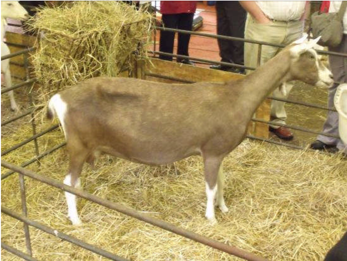
Figure 22. One of Roy's British Toggenburg females.