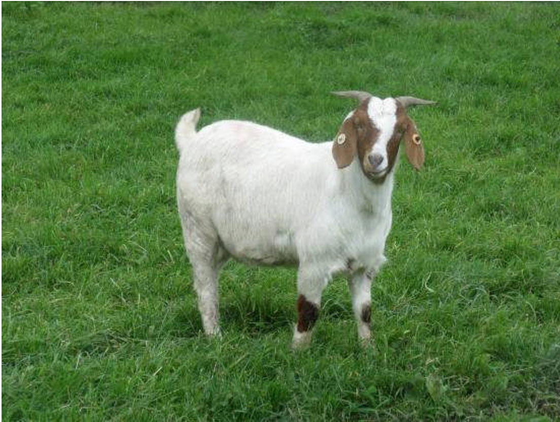
Figure 16. An excellent example of the quality of goat on the farm.

Most of the meat produced on the farm is sold through their website ( www.goat-meat.co.uk ). In Sharon's opinion there isn't enough profit in it for two people. A lot of first-time purchasers may visit the farm to ensure it is a genuine, quality product. There is apparently a lot of poor quality meat available including some mutton labelled as goat and this has deterred people from using goats' meat. However, most of the Peacock's business is from repeat customers.