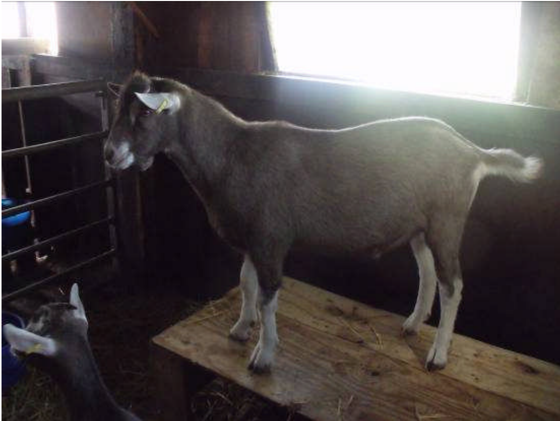
Figure 4. One of Jane's young males. No male kids are sold under 3 months of age.