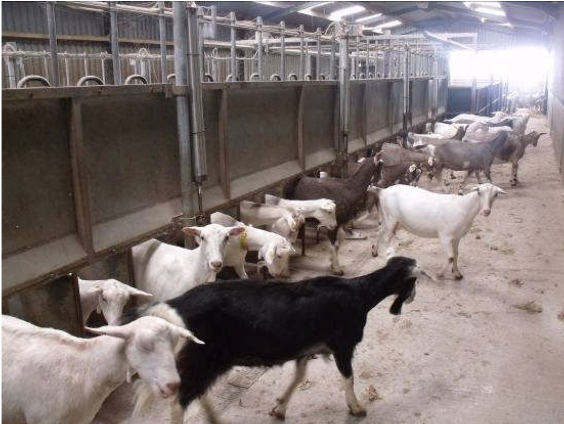
Figure 7. The goats exiting the parlour via the 'rapid exit' system.

The herd is vaccinated Johne's Disease and clostridial diseases. Enzovax and Toxovax are used and the creep used to feed kids is medicated to protect them from coccidiosis. The herd is scrapie monitored, free from CL and no animal has ever tested positive for CAE. However, since the animals are permanently housed and exposure to UV light is minimal, resistance to skin diseases is decreased. The standard of kid rearing is exceptional on this farm with a mortality rate of just 3%. Phil is adamant you cannot cut costs here as it will cost money later. A prescription was sought from the local vet and the milk powder now contains 2kgs Chlorosol per bag. This has very positive effect on health however it locks up Vitamin E so kids are administered a shot of it to prevent deficiency.