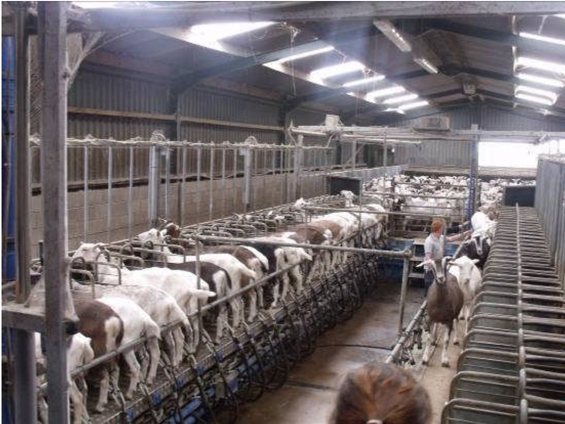
Figure 6. The goats coming into the parlour for milking.

An EID (Electronic Identification) system is also present and Phil says this was the best money ever spent. They always carry the 'handheld' with them and all information (deaths, treatments etc) is recorded instantly. All kids are tagged within 24 hours of birth before they are removed from their mother.