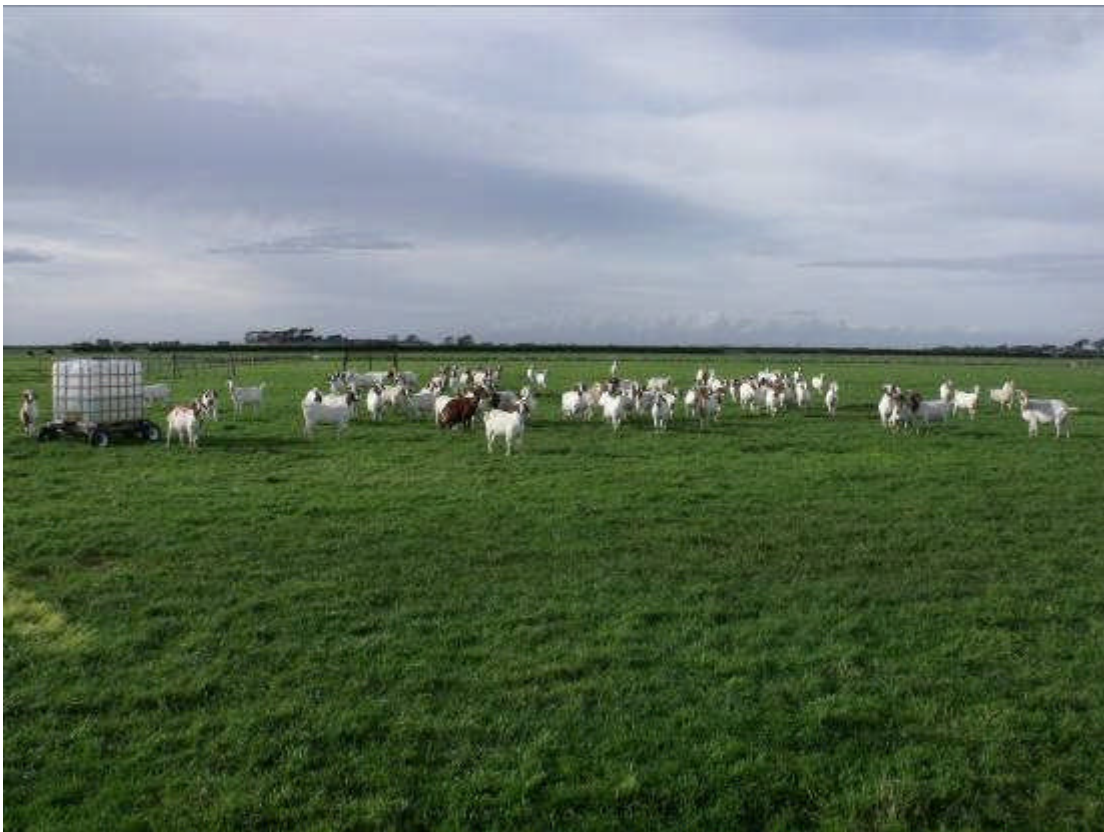
Figure 13. A group of grazing Boer and Boer crosses on Sharon's farm.

The Cockerham herd is one of the longest established meat goat herds in the UK, first established in 2000. Sharon Peacock and her husband Chris run the farm and currently have about 420 goats (140 breeding females), run over 40 acres.