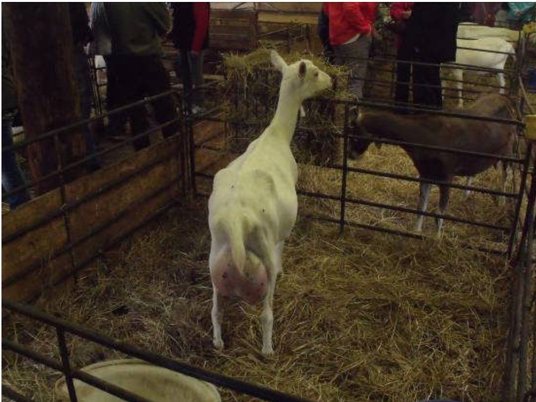
Figure 23. Excellent udder confirmation on this British Saanen.