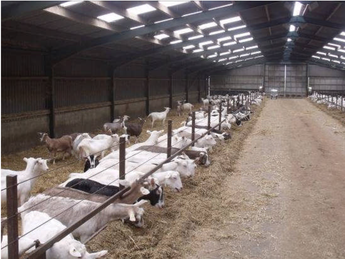
Figure 11. The mixed ration is fed along the central passage in the shed. Any waste feed is removed.

Phil 'lights' the goats with only around 4 hours of darkness each day. This practice is expensive but results in an additional 0.5l per head per day over about 6 months. Some of the herd is induced into oestrus artificially also using light treatment. The does are subjected to 60 days of intense lighting in January and February, then the lights are turned out and a Regulin implant is inserted in each animal's ear. Heat results approximately 30 days later. This allows for a conception rate of over 80%. It is important to have more bucks than with natural mating and Phil uses 1 per 40 does rather than 1 per 60 as is usual. Sponging has also been used previously but it resulted in too many multiple births.