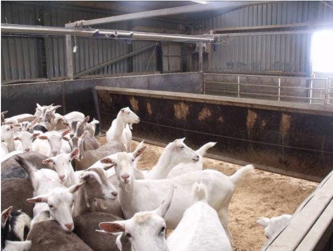
Figure 8. Goats stand on wood shavings in the collecting yard while awaiting milking.

Recently the practice of washing out the collecting yard has been stopped and it is now covered with a layer of sawdust. This has resulted in a substantial reduction in lameness in the herd from 13% to 4% but it has not improved beyond this (the aim is 2%). Phil thinks this may be down to the drinking bowl setup. Lime is placed under each of the drinking bowls in an effort to protect the feet. However if the shed was being built again Phil says he would provide a grid that would allow water to run away.