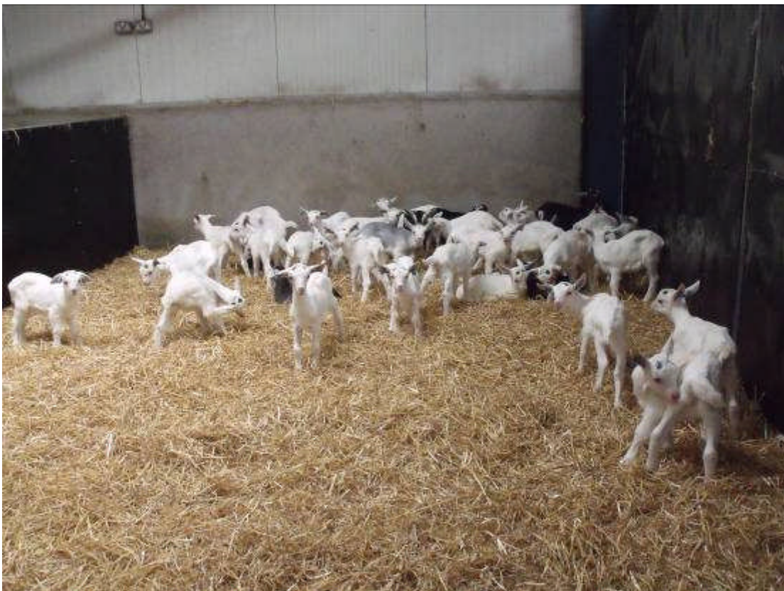
Figure 18. A group of kids shortly after disbudding.

Milking at Seaton Ross takes place through a fully automated 76 unit rotary parlour. However, all feeding takes place out of the parlour. All of the goats have an EID tag and are automatically milk recorded at every milking. They are also weighed as they leave the parlour and this information automatically tailors each animal's individual feeding programme. There is also an automatic drafting facility on the parlour to allow individual animals to be taken out for attention or treatment. Milk sampling is also carried out on a regular basis to test for any illnesses.