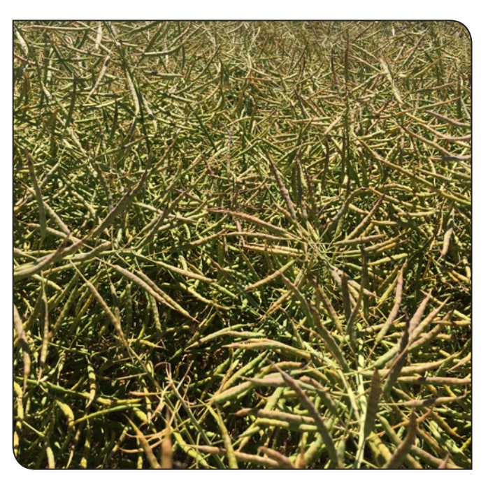
Winter oilseed rape is approaching timing for desiccation.