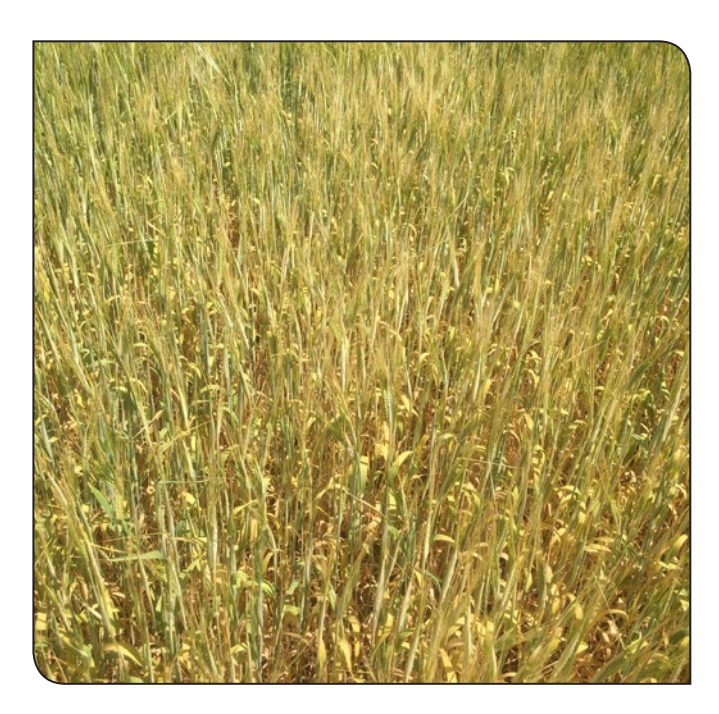
Spring barley suffering from drought conditions.