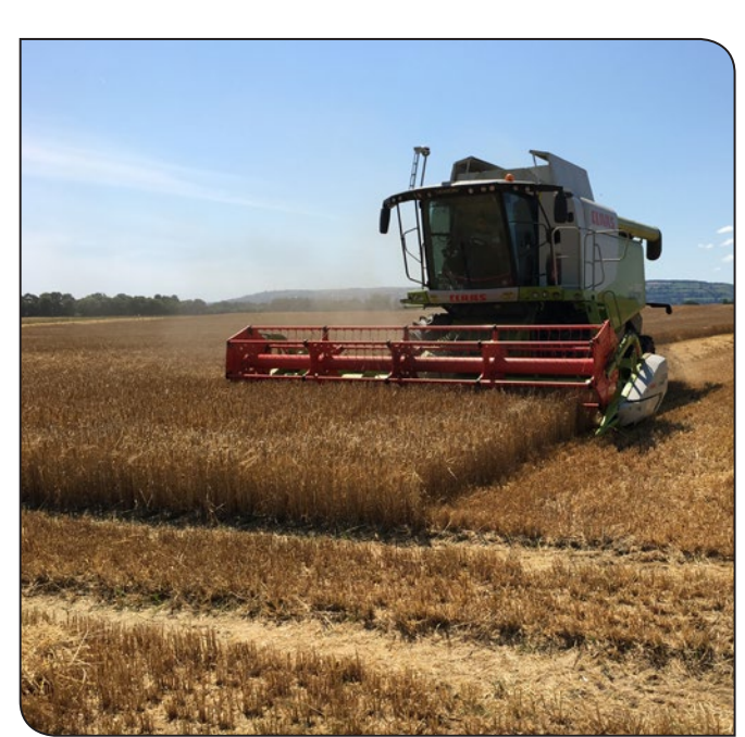
Winter barley has good yield potential and harvest will commence towards the end of the week.