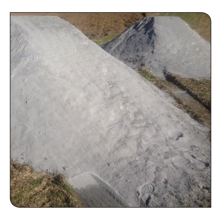
Now is a good time to apply lime to correct soil acidity and maintain soil pH 6.5 for optimum use of P & K fertilisers