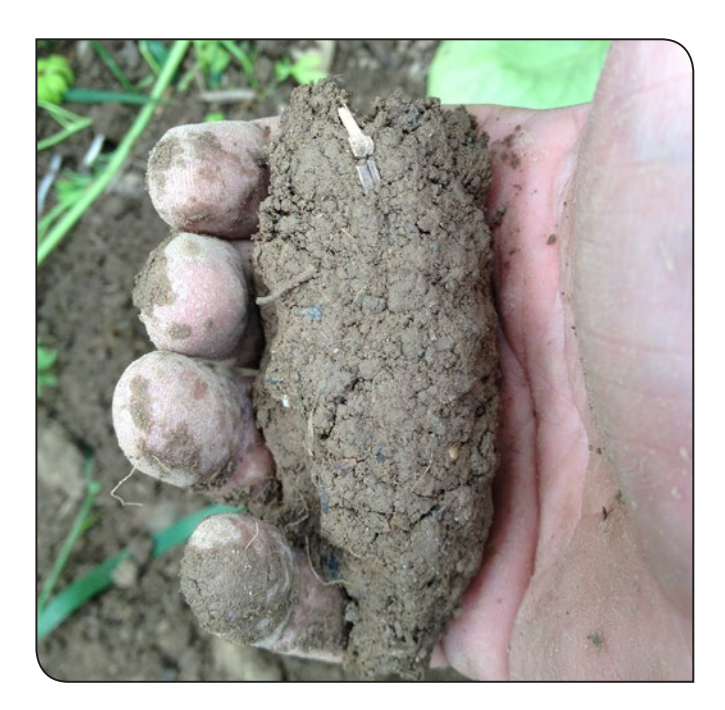
Check moisture levels before desiccating potato crops to ensure no damage to tubers when using diquat