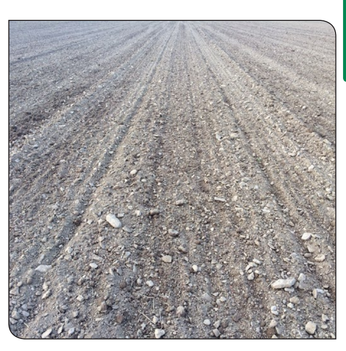
Pre-emergence herbicide applications will give best control of annual meadow grass. Post-emergence applications should be applied by GS 12.