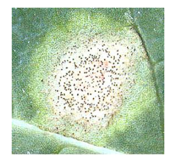
Leaf spot on rape