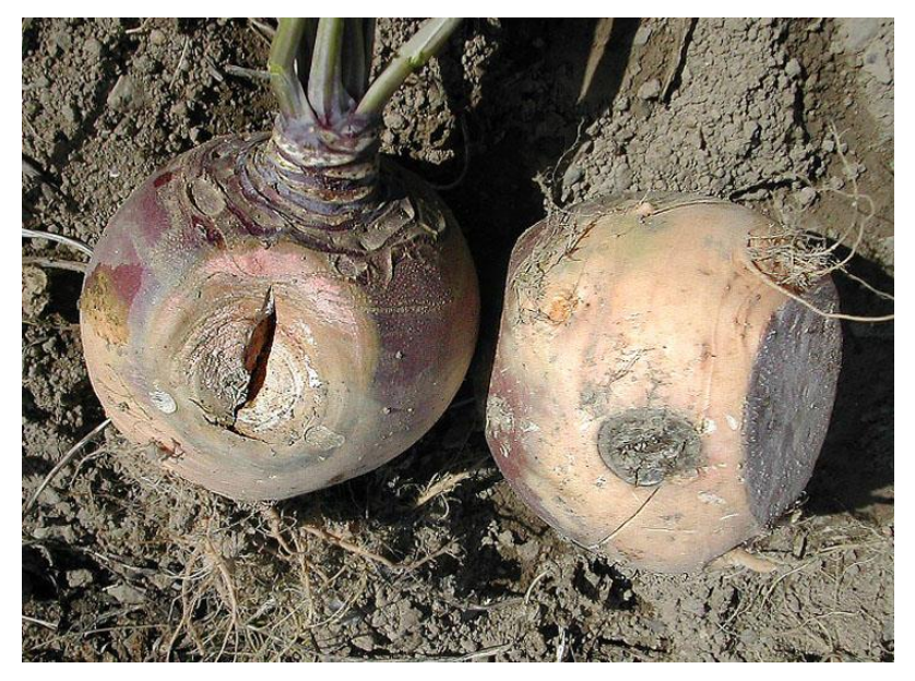
Typical dry rot symptoms