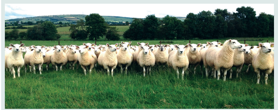
Grass growth rates were good for the most part in October.