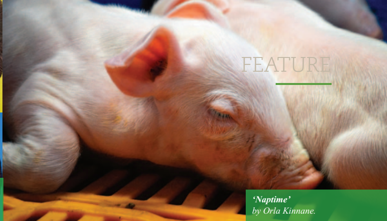
'Naptime' by Orla Kinnane.