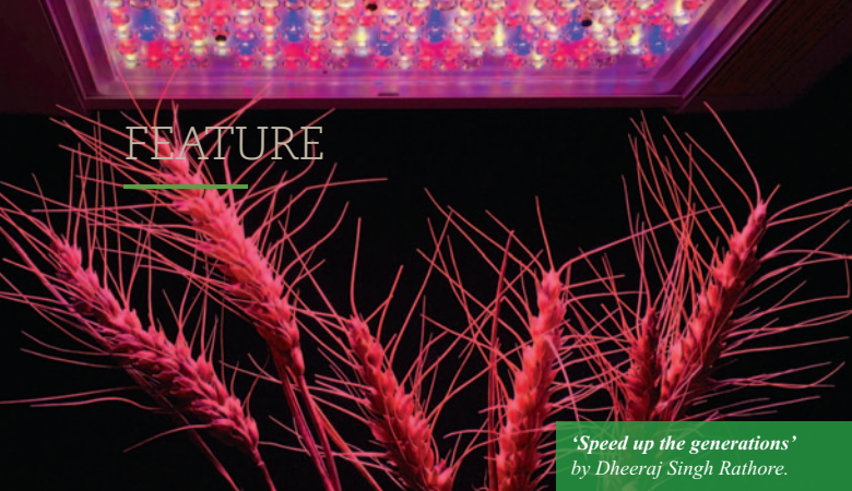
'Speed up the generations' by Dheeraj Singh Rathore.