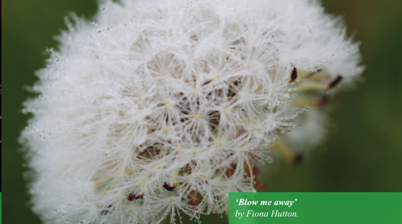
'Blow me away' by Fiona Hutton.