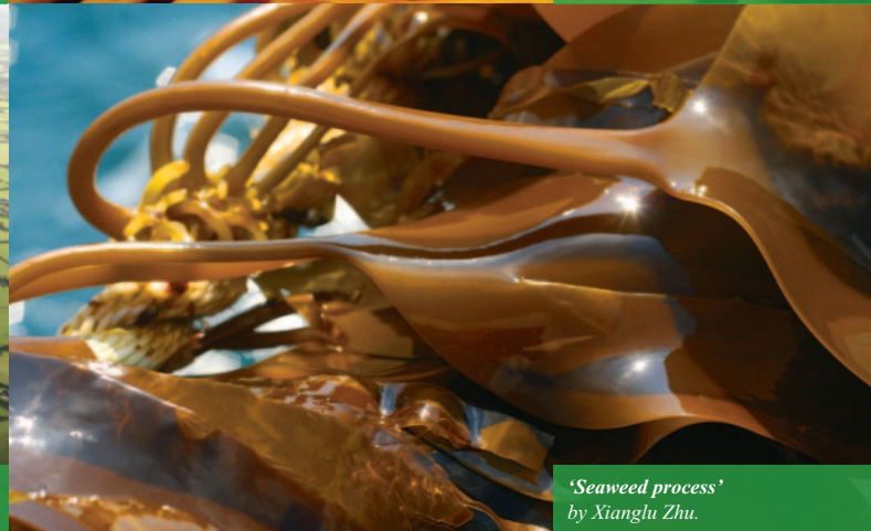
'Seaweed process' by Xianglu Zhu.