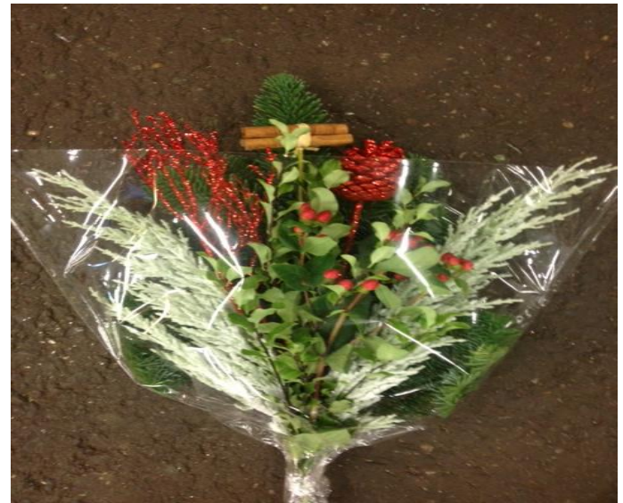
Packed at source foliage bouquet