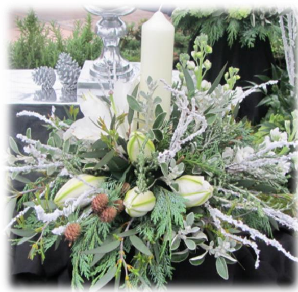
Finished table centre