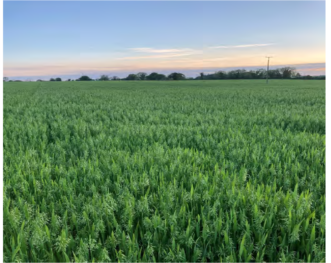
Same crop two weeks later