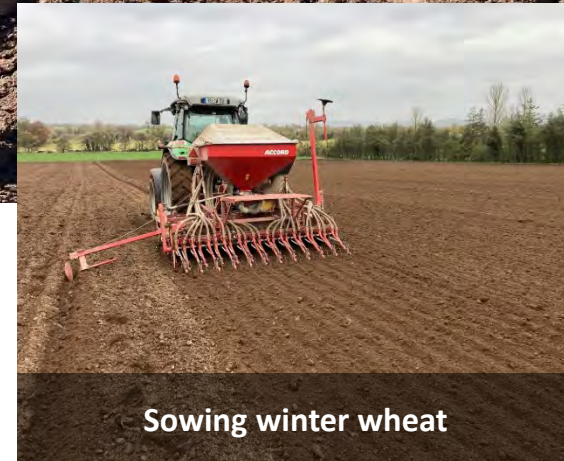
Sowing winter wheat