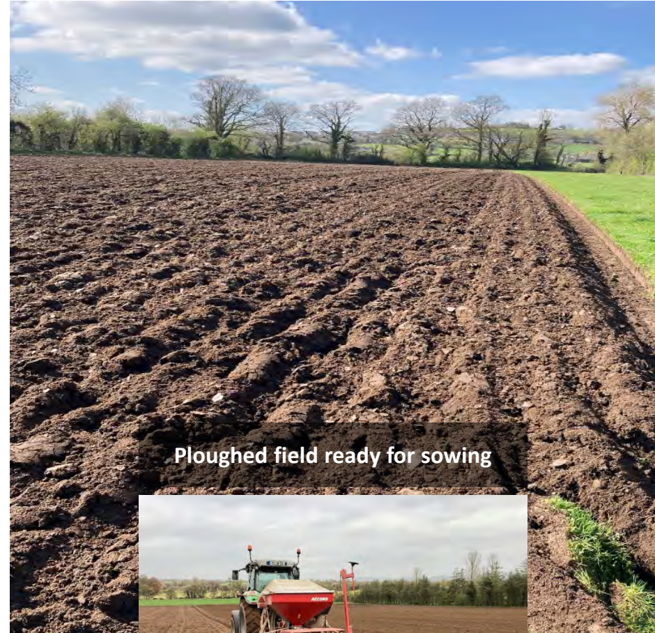
Ploughed field ready for sowing