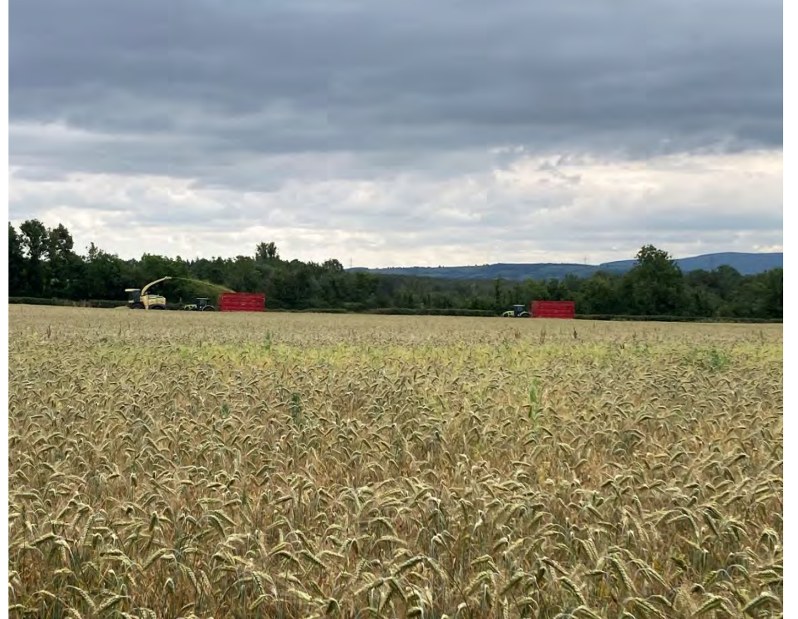
Harvesting arable silage