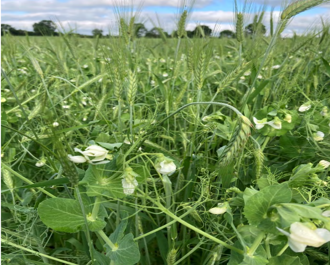
Arable silage pea triticale mix