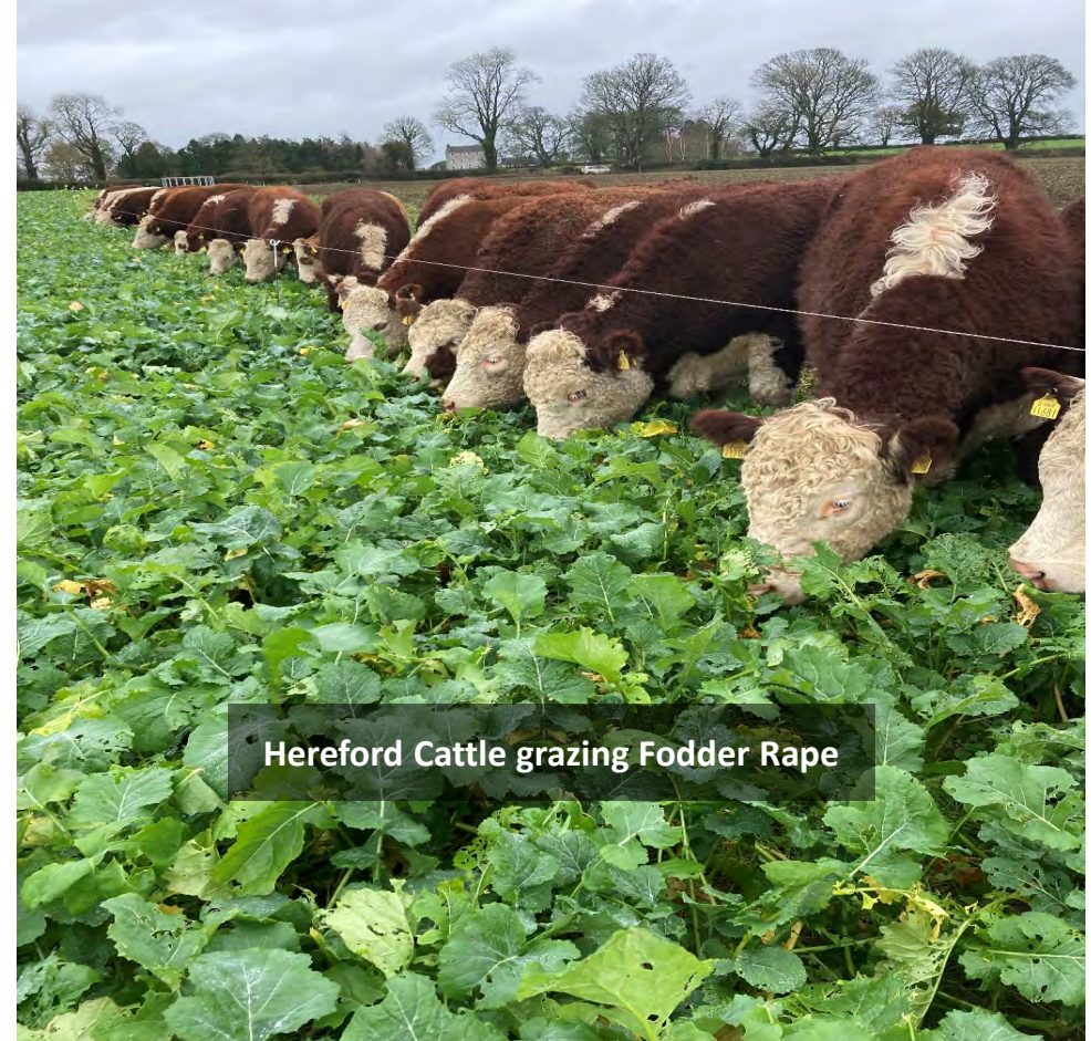
Hereford Cattle grazing Fodder Rape