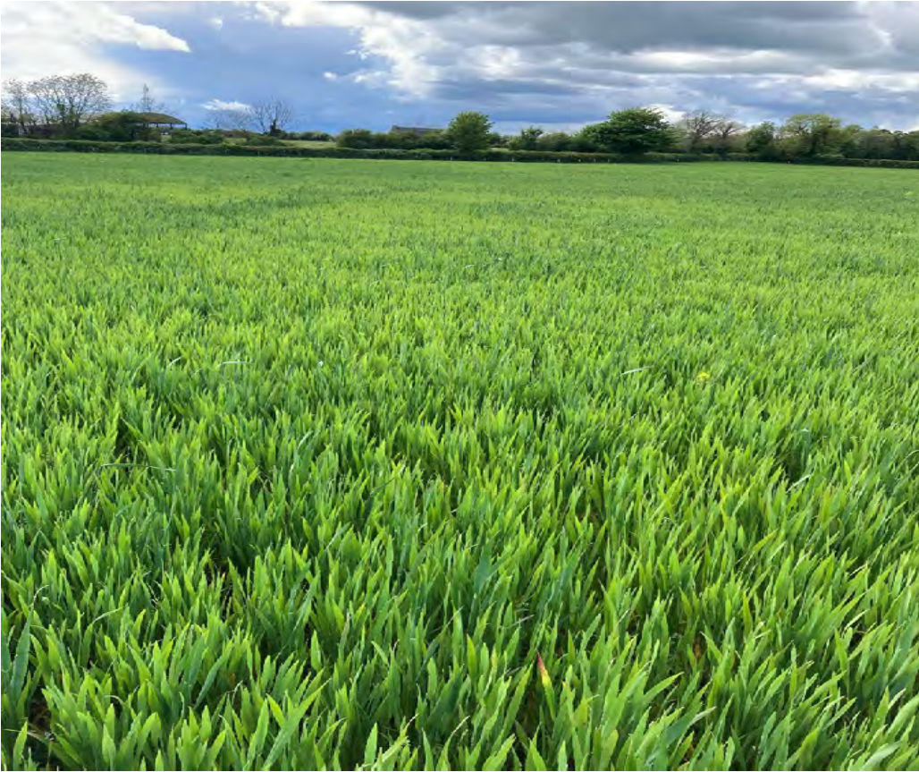
Winter oats end May