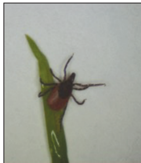
Ixodes ricinus female in search of a host

Ticks feed exclusively on blood. Even though they can live for up to 5 years (the average life span is 3 years), they take just three blood meals during their life time, one as larvae, one as nymphs and one as adults. Engorgement takes between 2 to 8 days for larvae, 4 to 10 days for nymphs and up to 13 days for adult females (adult males apparently do not engorge). Between feeds ticks shelter from adverse conditions in the vegetation and leaf litter where they digest their blood meal and moult to the next stage, or, in the case of the adult female, lay their eggs.