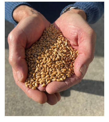
In 2021, Donal's organic wheat yielded exceptionally plump grains.

the farm is the introduction of a flock of 400 laying hens. This gives the Keanes, as Donal says, "a direct connection with customers.'