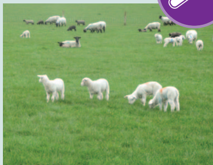
Lambing commenced in the INZAC flock on February 28, 2022.

Lambing commenced in the INZAC flock on February 28, 2022. Having our ewes synchronised prior to AI in early October means that our lambing spread has been quite compact, with 65% of the ewes lambed at the time of writing (March 14). Lamb mortality is running at approximately 5% on average. Lamb birth weights are ranging from 5.84kg for singles, 5.43kg for twins, and 4.20kg for triplets. The body condition score (BCS) of our ewes dropped slightly from scanning to lambing; however, colostrum supplies have been good. The importance of colostrum cannot be underestimated as it provides nutrients and vital antibodies to the newborn lamb, while also acting as a laxative. Every effort was made in our flock to ensure that lambs received ewes' colostrum through suckling or via hand milking and stomach tubing within the first two hours of birth. Data recording takes up a lot of our time at lambing, but we find it pays dividends as the year progresses. In addition, recording information on problem ewes is crucial when making culling decisions later in the year. Our current average farm cover is lower than in 2021 at 495kg DM/ha, while grass covers on the first paddocks being grazed are between 6cm and 8cm (800-1,200kg DM/ha). Covers on the later closed paddocks are