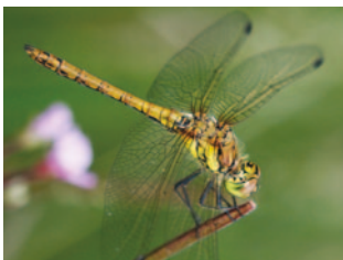
Dragonfly