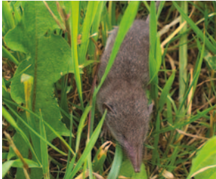
Shrew