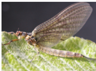
Mayfly