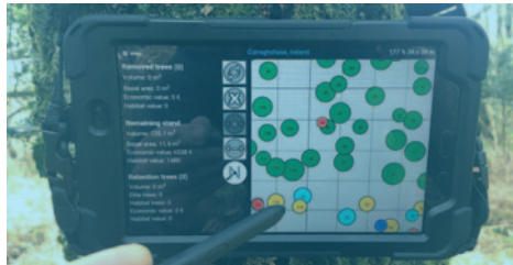
Marteloscope workshops encourage learning by doing.

and the other many important services that forests can provide to owners and society.