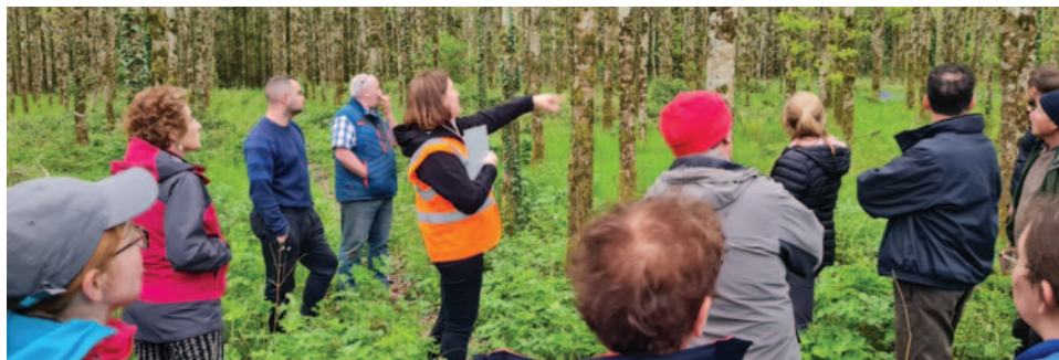
Forest events are a great opportunity to see tree planting in action, meet with forest owners and understand different forest types and management based on specific objectives.