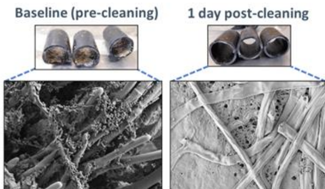
Figure 2. Scanning electron microscopy (SEM) images of the internal feed pipe surface before and after cleaning.

We also saw this after using scanning electron microscopy (SEM) on sections of the feed pipe that we removed from the system (Figure 2). Moulds and bacteria were widespread in the pipe before cleaning but one day after cleaning, these moulds were damaged and were not found for the duration of the trial, which indicated that they were killed off completely. Despite the improved hygiene of the system, there was little impact on the microbiology of the liquid feed itself.