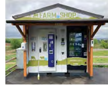
Milk Vending Equipment