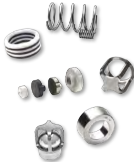
Spare Parts and Components