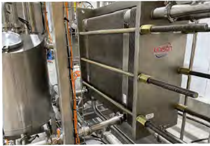
Heat Exchanger Integrity testing systems