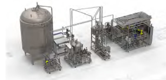
Complete Processing, Filling & Packing Lines