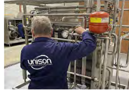
Process Equipment Servicing