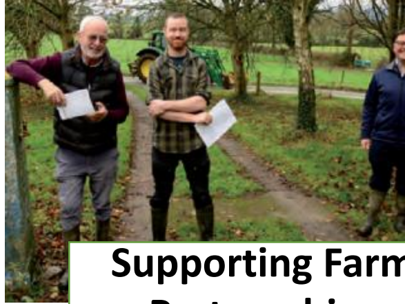
Supporting Farm Partnerships