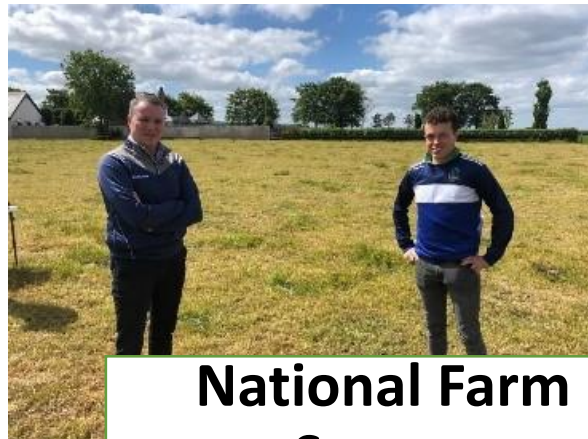
National Farm Survey