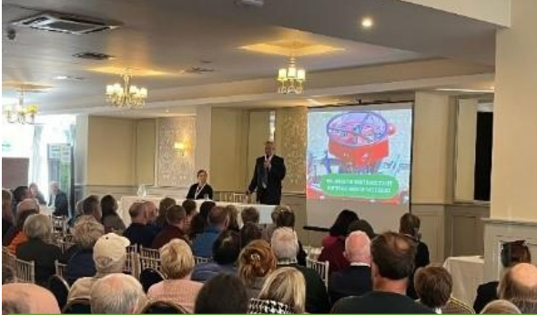
Transferring the Family Farm Clinics