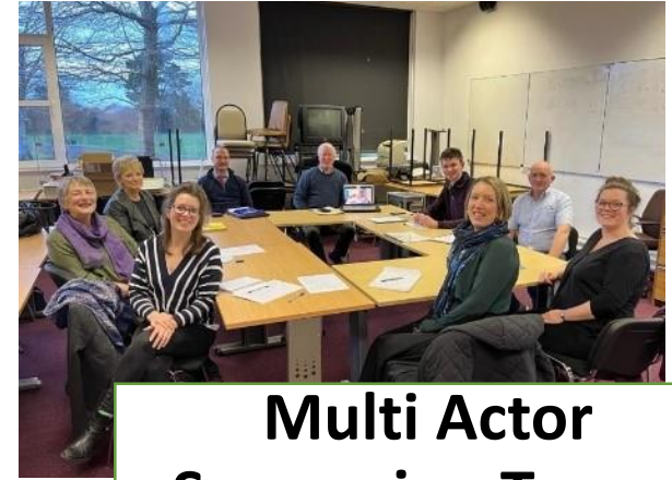
Multi Actor Succession Teams