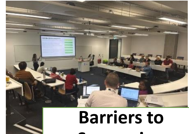
Barriers to Succession