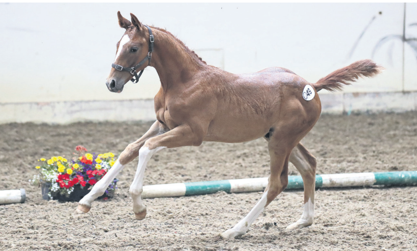
A colt by Kannan out of MHS Pembroke Lady, by Guidam, sold for €17,000 at the 2017 Irish Breeders Classic Foal Sale.