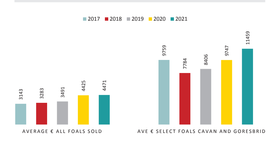
FIGURE 2: AVERAGE SALE PRICE OF FOALS

The number of foals sold at public auction in 2021 increased by almost 100 foals (30%) on those sold in 2020. Just shy of 160 (23%) more three-year-olds were sold than in 2020, the highest number sold in both age groups over the five-year period 2017-2021.