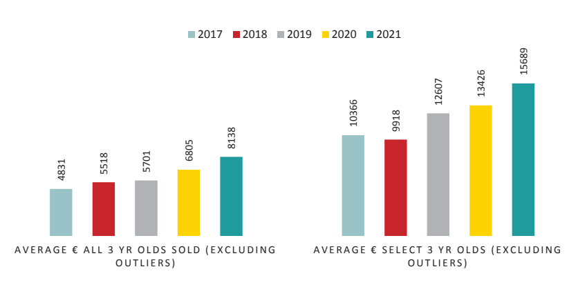
FIGURE 6: AVERAGE SALES PRICE OF THREE YEAR OLDS. EXCLUDING OUTLIERS

Outliers were allocated as top prices separated by greater than €2,000 from those below. Outliers were noted as follows: 2017 (€31,000; €35,000, €36,000); 2018 (€45,000 x2; €46,000; €59,000); 2019 (€34,000, €36,000, €41,000); 2020 (€37,000; €38,000; €42,000; €47,000); 2021 (€45,000, €48,000; €82,000)