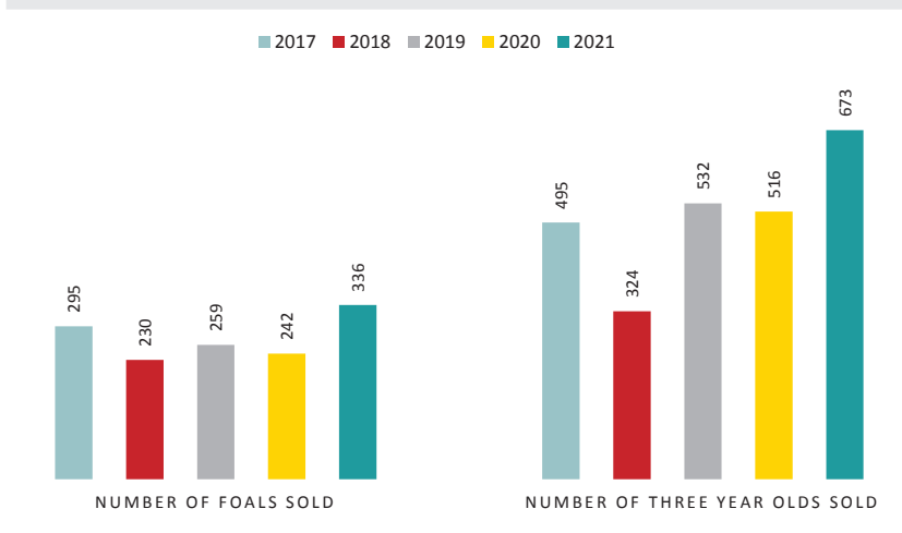
FIGURE 1: NUMBER OF FOALS AND THREE-YEAR-OLDS SOLD

The sales returns assessed include Cavan, Goresbridge (including Supreme Foal Sale and Go for Gold sales), Mullingar Equestrian Horse Sales, Monart Sale of Eventers, and Mayo Roscommon Horse Breeders sale. The results exclude the Irish Draught sales and the sale of ponies.